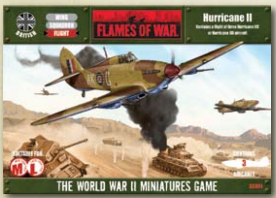
The Hurricane IIC armed with four 20mm wing-mounted cannons became the standard production model. The Hurricane IID mounted two 40mm under-wing anti-tank guns, making it one of the premier tank busters of WWII.

Designed to replace the World War I 18 pdr gun the 25 pdr fought from 1940 to the end of the war. It proved excellent in both the artillery and anti-tank role, and saw service with all Commonwealth forces and in all theatres.