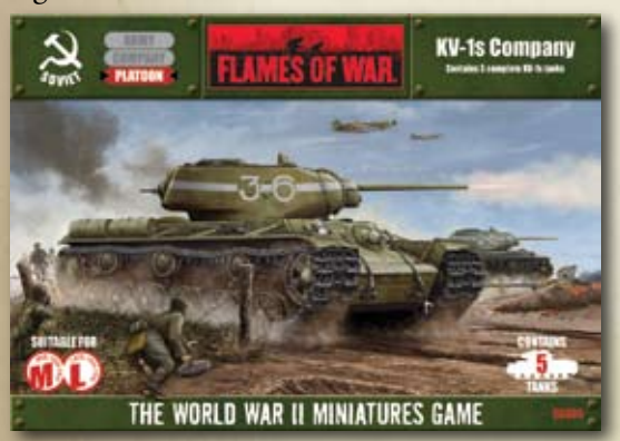
Lighter, faster and more reliable than the KV-Ie, the KV-1s was mainly issued to Guards Heavy Tank Regiments. Able to keep up with infantry and medium tanks, the firepower from KV-1s tanks was the backbone of Soviet attacks.

After encountering the Tiger and Panther tanks at Kursk it was decided that the T-34 needed to be upgraded. This was done by creating a new turret with an 85mm gun, creating one of the most successful tanks of the war.