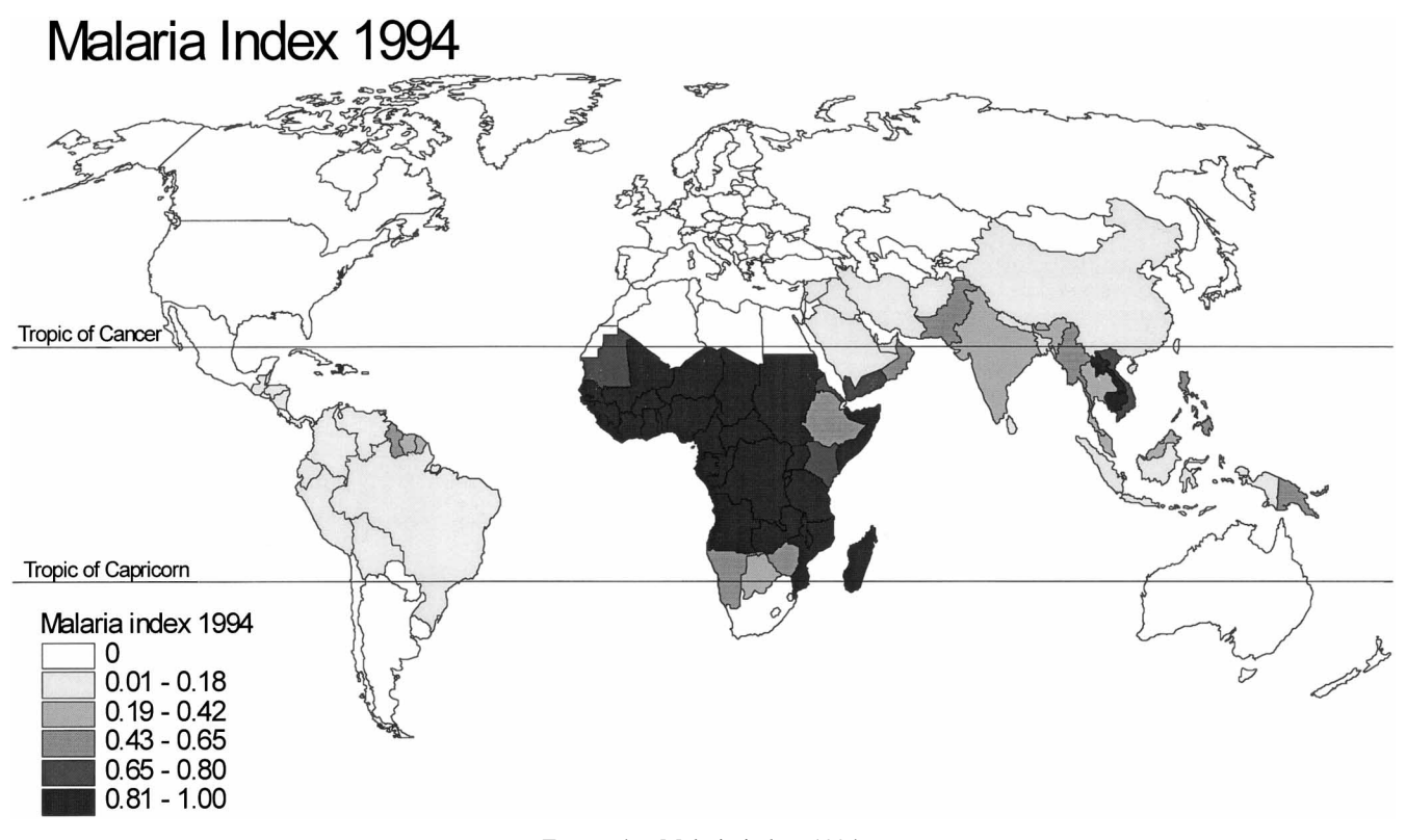
FIGURE 4. Malaria index, 1994.

responsible both for economic growth and successful malaria control. In this case, the estimates of the effect of malaria reduction on economic growth would be biased. To control for the possible endogeneity of malaria reduction, Regression 3 in Table 7 uses instrumental variables. The instruments are the prevalence of 53 different Anopheles mosquito vectors in each country in 1952. (The Anopheles data were digitized from an American Geographical Society map34 and used to calculate the percentage of land area in each country affected by each Anopheles species.) The different Anopheles mosquitoes vary widely in their efficacy in transmitting human malaria, so that the distribution of Anopheles vectors is strongly correlated with malaria intensity and its change (the first-stage regression of the change in the malaria index on Anopheles vectors has an R^2 of 0.51). There is no reason to think that the distribution of malaria mosquito vectors is a cause of economic growth apart from the direct influence of malaria, making vector prevalence an ideal instrument for malaria change. After correcting for the possible endogeneity of malaria reduction, the estimated effect on economic growth is essentially unchanged, so it is unlikely that the changes in malaria prevalence are a consequence of economic growth. A Hausman test finds no significant difference the ordinary least-squares and instrumental variables estimates, rejecting the endogeneity of the change in malaria.