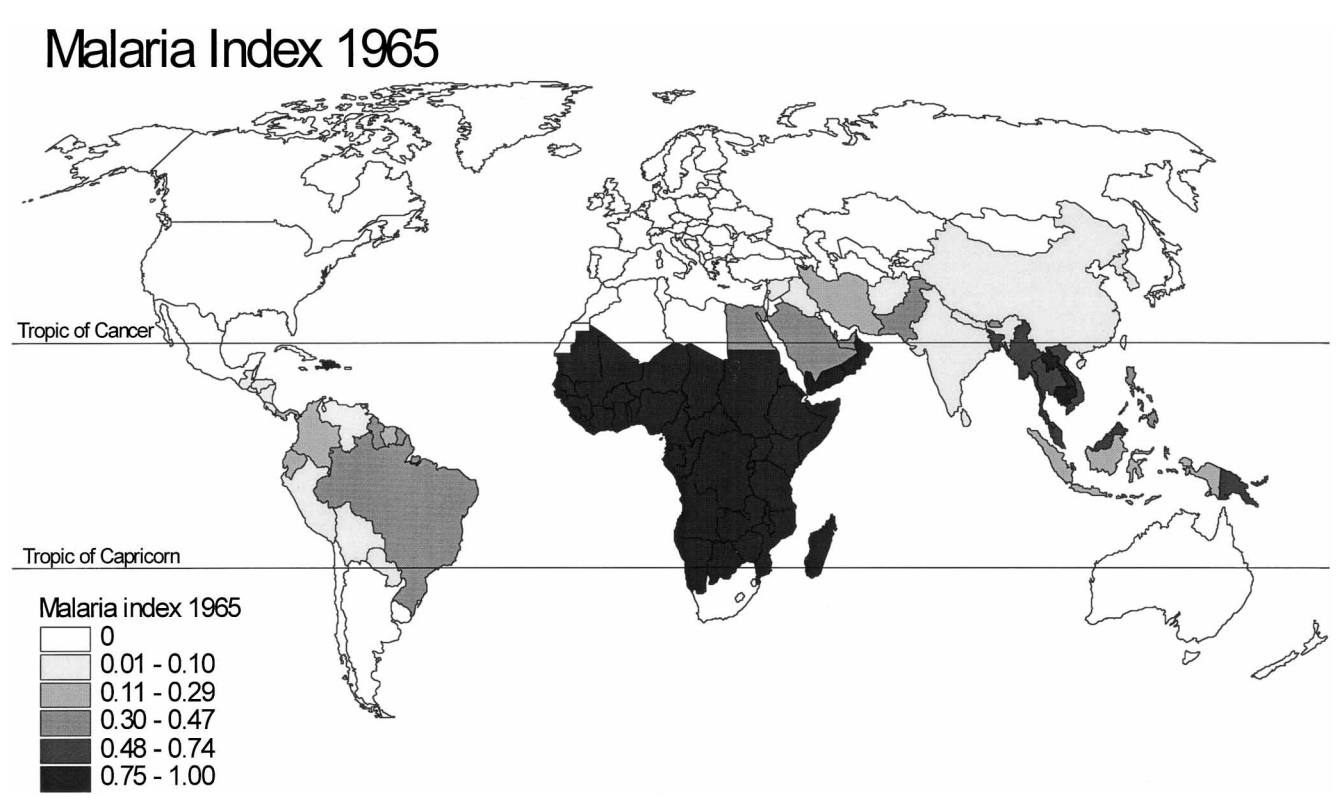
FIGURE 3. Malaria index, 1965.

<sup>†</sup> Robust t -statistics are in parentheses. * Significant at 5% level. ** Significant at 1% level.