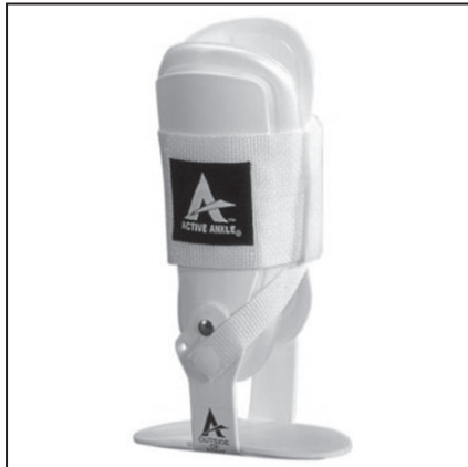
Fig. 2. The Active Ankle T2 brace.

The results revealed a significant effect of ankle bracing on medial–lateral knee forces during all of the lateral movement tasks (Table 2). The averaged peak