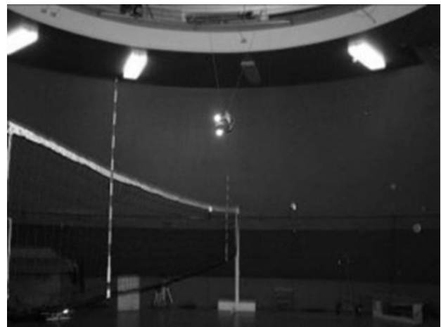
Fig. 1. Data collection setup, including spike ball position.

The series of tasks included a set of straight-line tasks (running, blocking and spiking) which included movements in only one direction, and a set of lateral tasks (cutting, block and push off, and spike and cover) which included movements involving a change of direction. These tasks were selected in consultation with the Australian Volleyball Team physiotherapist and Australian