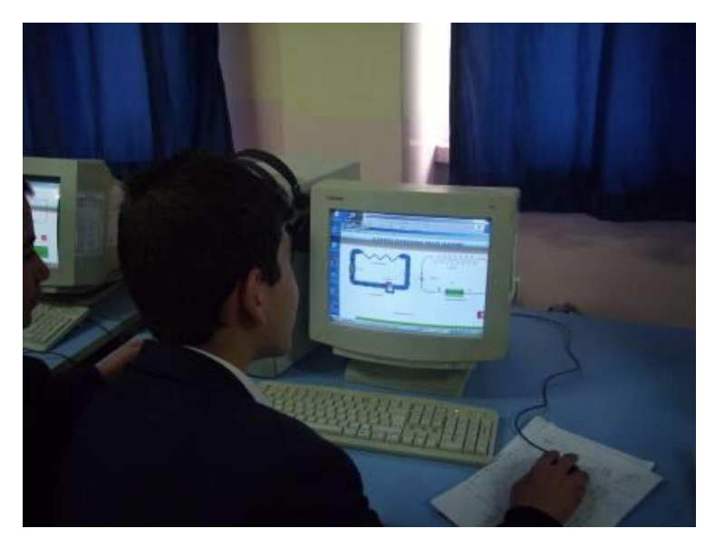
Figure 2. Sample of analogy-based simulation environment for control group II in a computerized classroom of Turkish elementary school.