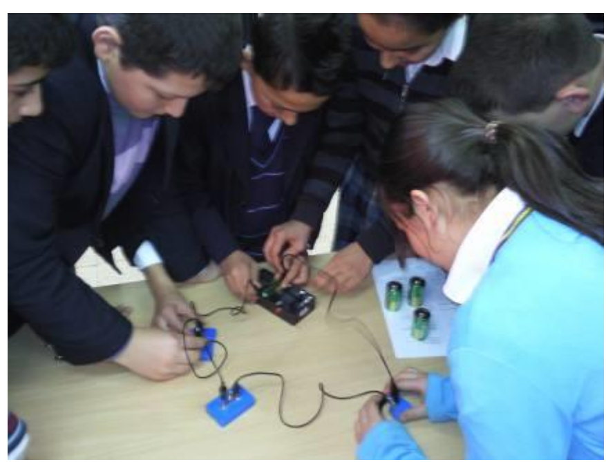
Figure 1. Sample of laboratory environment for control group I in a classroom of Turkish elementary school.

Analogy-based simulation Environment for Control Group II: Students assigned to the Analogy-simulation Environment tried to learn the basic concepts of circuit and the relationship among them in a computerized classroom with an online electricity analogy-based simulation, the 'Electricity Analogy-based Simulation Tool (EAST)' (see Figure 2 and 3). The activities in EAST were developed by originating the analogy of fluid system of Hewitt (1987) in virtual environment.