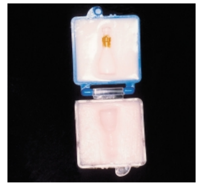
Fig. 2 Split mold technique used to wax up the implant superstructures.

mounting jig (Fig. 3). A 35-Ncm torque wrench (Nobel Biocare Steri-Oss, Yorba Linda, CA) was used to tighten the abutment screws (to the torque recommended by Steri-Oss), and a urethane-based composite resin with silicon dioxide fillers (Fermit-N, Vivadent, Amherst, NY) was used to fill in the screw access openings.