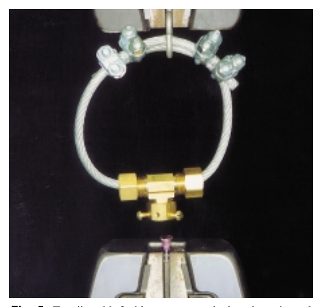
Fig. 5 Test jig with 3 side screws attached to the universal testing machine to test the cement failure load.