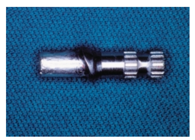
Fig. 1 Platinum foil of 0.001-in (25-\mu m) thickness used on the abutment surface as a die spacer.

To provide an even thickness for the luting agent, a 0.001-inch (25-mm)-thick platinum foil was closely adapted and burnished onto the abutment surface as a die spacer (Fig. 1).<sup>(3)</sup> The abutment/analog assembly with the platinum foil in place was duplicated with silicon material (REDU-IT Duplicating Material, American Dental Supply, PA) and Microstone (Whip-Mix, KY). An 8-mm-diameter flat occlusal surface wax superstructure was built up on this stone replica. By utilizing a split-mold technique (Fig. 2) with silicone material, all 56 specimens were waxed to an identical size with an 8-mmdiameter flat occlusal surface to facilitate testing. The specimens were then sprued on the occlusal surfaces, invested with Jelenko phosphate-bonded investment, and cast with Electra (a silver palladium alloy, Ivoclar Williams, Amherst, NY) at 760°C (1400°F). The specimens were then retrieved from the casting rings, the investment materials were cleaned with a steam cleaner (Pro-Craft II Steamer Cleaner, Ivoclar North America, Amherst, NY), the casting qualities were checked, and the specimens were polished with rubber wheels. Moreover, a seating jig was fabricated with Duralay in order to mount the implant abutment/analog assembly into the mounting jig while maintaining a precise alignment. Acrylic resin was used to fix the assembly in the