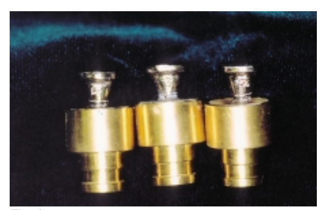
Fig. 4 Superstructures cemented onto the abutments.

All specimens were subjected to 100,000 cycles (with stainless-steel metal styli) at 1.2 Hz in the chewing machine with a force of 75 N which is equal to a 3-year chewing cycle in vivo.<sup>(14)</sup> Specimens then were subjected to 1000 temperature cycles of between 5 and 55°C with a 1-min dwell time in water baths (each side for 30 s).