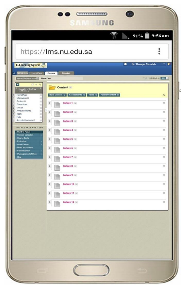
Figure 3. Mobile phone-based website content

For the sake of completing building the mobile phone-based website, the teaching content of the "Strategies of Teaching and Learning" course was prepared, split into separate lectures using PowerPoint presentation, and uploaded to Blackboard System provided by Najran University. The course consisted of twelve lectures and could be accessed by clicking a link called 'Content" placed in the upper left corner of the main screen. In addition to the "Content" link, other links for discussions, groups, poster, and tools were added to encourage interaction among students themselves on one hand, and between students and instructor, on the other hand. Figure (3) illustrates mobile phone-based website content.