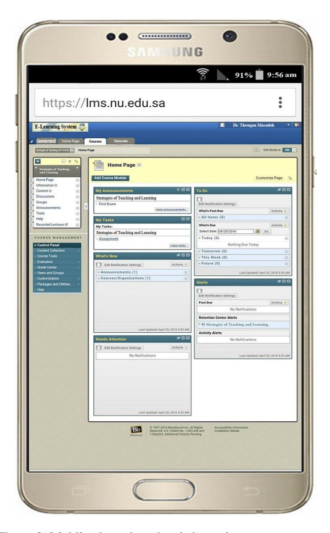
Figure 2. Mobile phone-based website main screen

virtual relations with peers; in addition to the blogs as open communication tools for students to share their ideas were provided by the proposed website delivered via blackboard-based Mobile Learning. Figure (1) also shows that there are three intersections among the three circles, namely DL, DS, and LS. The first intersection "Device Usability (DL)" cares about the common characteristics of aspects related to devices, on one hand, and aspects related to the learner, on the other hand, i.e. tasks dealing with knowledge and its storage. Thus, researchers' reliance on this point was based on the participants' background knowledge in the use of smart mobile phones encouraged by their high economic level and continual carefulness to follow up and keep the most recent devices. Furthermore, they all seemed to be highly capable of accessing, downloading, and saving information via their mobile sets. The second intersection "Social Technology (DS)" represents the social aspect of Mobile Learning, which is fulfilled through forums, groups, and available blogs for students to interact via their mobile phones. The last intersection "Interactive Learning (LS)" accounts for theories of learning and teaching. Figure (2) illustrates mobile phone-based website main screen, which was mainly developed for teaching students.