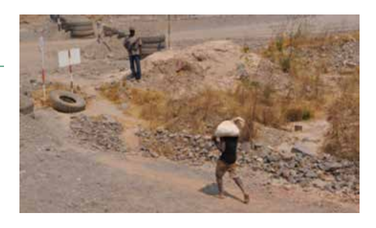
Non-uniformed armed guards on LSM mine sites tolerate, or even encourage, clandestine ASM

concessions but this in itself can result in human rights risks relating to the appropriate use of force. <sup>3</sup>