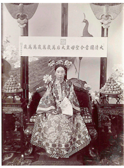
Cixi's official portrait for diplomatic visitors [cx202]

Cixi's love of rich decorative elements and theatrical settings are in sharp contrast to traditional Chinese studio photographs (left) with their spare use of props.