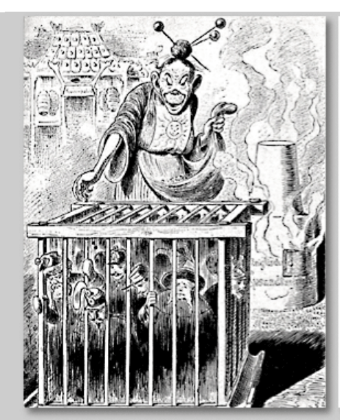
Kikeriki, No. 97 June 12, 1900 (Austria) caption "Cette bonne impératrice de Chine garde soigneusement dans le plus intime de son palais, les représentants des puissances. Alors! que signifie?" (This good empress of China carefully guards in the innermost part of the palace the representatives of the Powers. So! what does that mean?) [cx235]