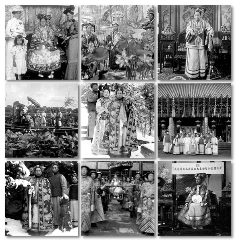
Details from a selection of Xunling's photographs of the Empress Dowager Cixi—regent of China for 47 years—show the types of poses, dress, and settings she wanted to present as her official image.

Finally, the question remains as to whether the photographs were intended as a means of instilling loyalty to the Empress Dowager among her Chinese subjects. Almost immediately following their production, copies of the photographs were being sold on the streets of Chinese cities. Regardless of whether the court actively encouraged their distribution in the manner of other world leaders such as Queen Victoria, or whether they were helpless to prevent them from leaking out, the photographic portraits became a prevalent and enduring symbol of a dying and decadent reign, lending visual form to a dramatic character that would eventually materialize into the "Dragon Lady" in countless Chinese and foreign films of the 20th century.