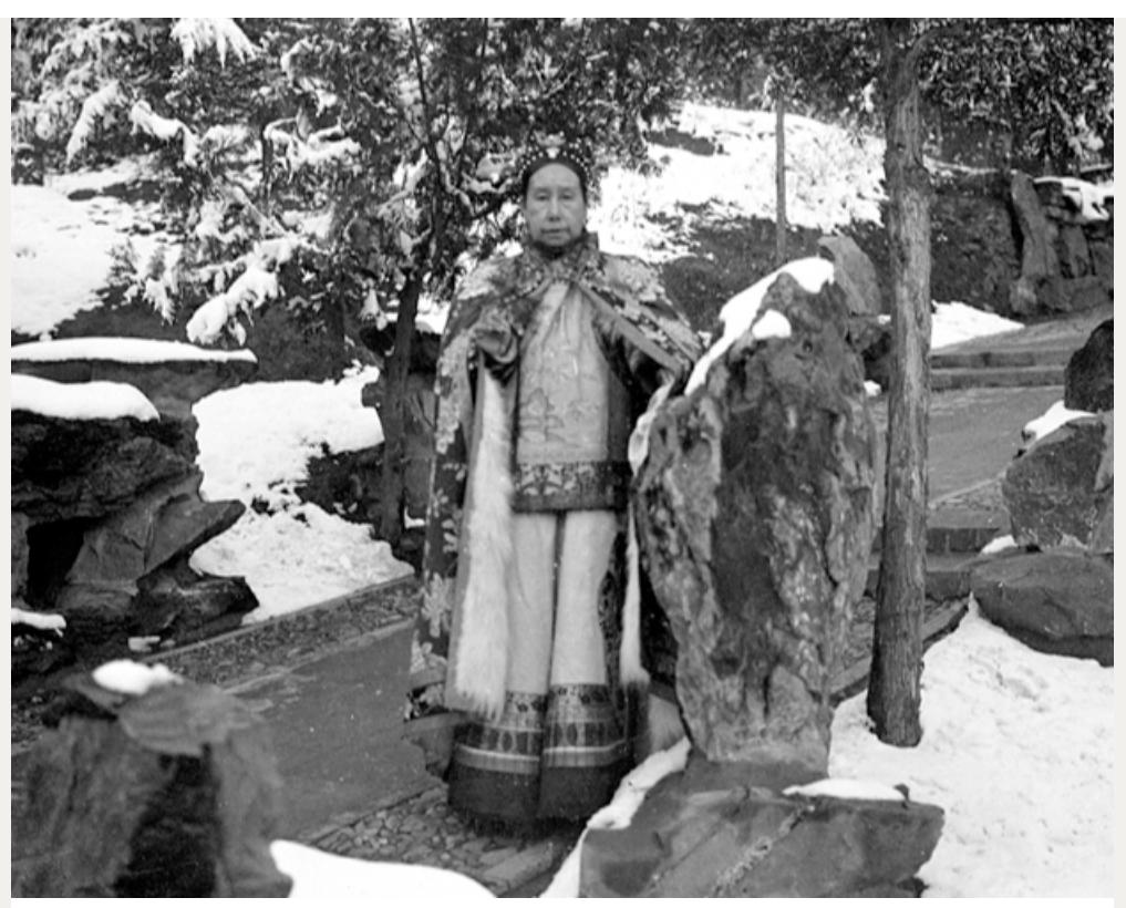
An informal portrait in the garden of Yiheyuan detail [cx116]

Without question, Xunling was an amateur photographer with limited technical skills. Yet in spite of his limitations, the images are compelling. While some commentators call Xunling China's first art photographer, it may be a stretch to ascribe artistry to an amateur photographer with such a limited, anomalous portfolio; yet there is undeniably a majestic quality to many of the photographs that transcends Xunling's abilities, probably due to Cixi's own artistic engagement in the process.