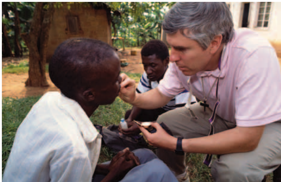
“AIDS Patient Receiving Communion”

Catholics remain faithful to the truth of Jesus' real presence in the elements. The Eucharist is truly the body of Christ. “My flesh,” Jesus tells us, “is food indeed and my blood is real drink. He who eats my flesh and drinks my blood lives in me and I live in him” (Jn 6:55-57). This understanding of Christ's real presence in the Eucharist is broader than his real presence in the elements. Christ is also present in the Scriptures we proclaim as we break open the word. As the fathers of the Church always insisted, it is Christ who speaks to us through the Scripture and who preaches. He is also present in the assembly, which becomes, no less, his body. The symbol of the body of Christ is a metaphor for the real transformation of elements, human words, and community. It also is a potent symbol of a social justice of inclusiveness. The body, though composed of many parts, is,