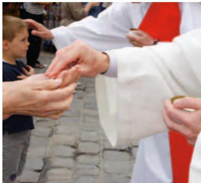
“Holy Communion”

This means encouraging them to figure out how they should live now that they’ve celebrated and received Eucharist. Here, raising good questions may be more effective than giving directives. So, consider asking, where and how is Jesus inviting you? How are you to reach out with love and care for others, to share your Eucharist with the world? What might you try to do or change in your life? While Jesus is your best