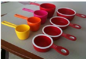
Figure 2a. Standard kitchen measuring cups.

As with traditional instructional representations, such as area models and number lines, a key affordance of measuring cups is that they enable students to harness their visual modality to support their mathematical judgments. Thus, to compare the unit fractions \frac{1}{3} and \frac{1}{4} , one could place the respective measuring cups side-by-side (see Figure 2b). More importantly, the measuring cup activities provide a tangible means for teachers to guide students to physically enact situations they believe are analogous to the mathematical schemes they wish students to develop. For example, to help students develop a part-to-whole scheme, students could be guided to enact a situation in which they iterated the same volume from a unit-fraction cup into a one-whole cup measurer until it was filled (see Figure 2c). These activities also provide opportunities for teachers to observe and assess student reasoning.