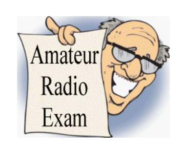
VE TESTING at 11am. Sponsored by the "Ingham County VE Group". Walk-ins are Welcome!!

From 8am to 2pm (1200 UTC to 1800 UTC) on Saturday, July 26, 2014. Frequencies are: 14.260 HF and 145.00 VHF (simplex). QSL cards available.