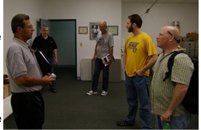
Wrapping up after the latest Tech Class

Know anyone who might want to stop by for some classes? Email <u>WX8MOJ@arrl.net!</u>