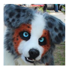
"TYCHO AUSSIE" CMARC's 6' 3" Mascot will be back again this year!!