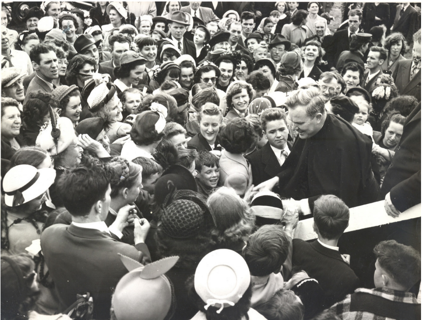
Father Patrick Peyton, C.S.C., greeted by a number of the faithful in Nova Scotia, 1951.