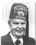
John Diefenbaker Former Prime Minister of Canada