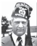
Buzz Aldrin Astronaut

The Shriners fraternity includes a number of past and present heads of government, business leaders, entertainers and sports legends. They include: