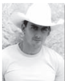
Brad Paisley Country Singer