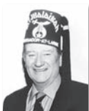
John Wayne Actor