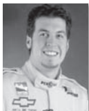
Sam Hornish, Jr. Race Car Driver