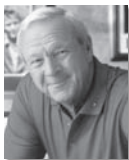
Arnold Palmer Golfer