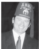
Richard Tyson Actor