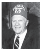
Gerald Ford Former President