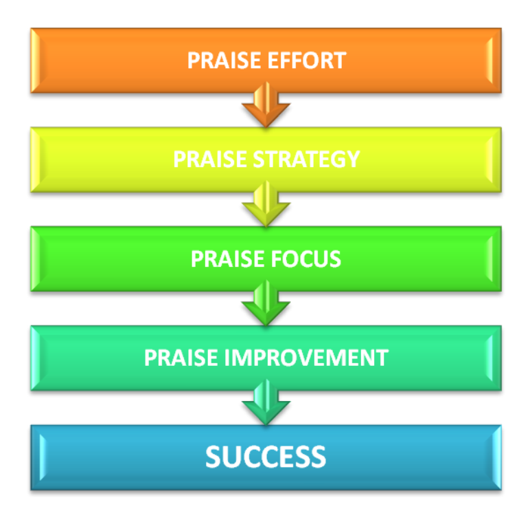
Figure 2 – Praise the process (adapted from Dweck, 2006)

As well as giving the right sort of praise, honest and constructive criticism is important to encourage the growth mindset because teachers and parents can help children improve, resolve something or do a better job of something. But for the criticism to be constructive, the person offering it must ensure that no element of judgement creeps into it because as previously identified, judgement is one of the key characteristics of the fixed mindset and there is no place for that in the classroom.