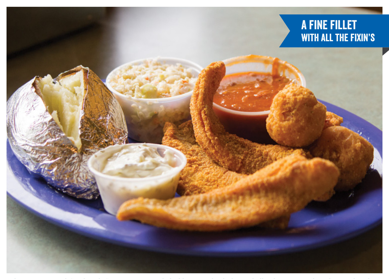
Editor's Note: Mud Creek Fish Camp prepares its baked beans and coleslaw in bulk. These recipes have been reduced.