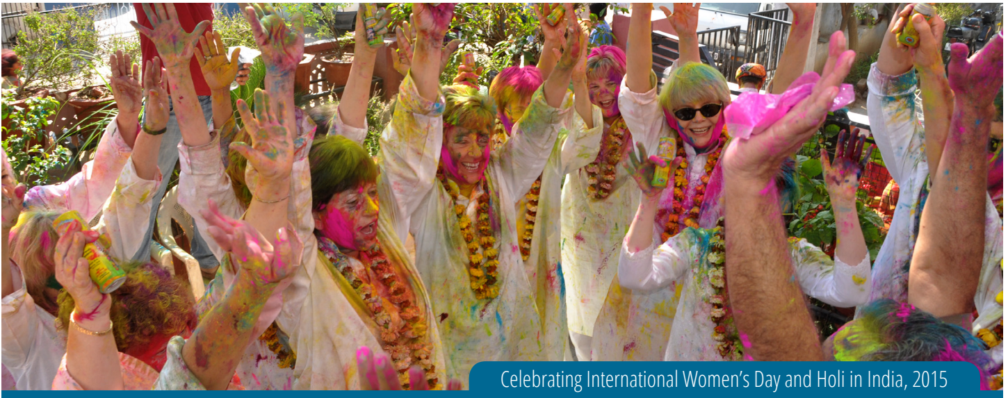
Celebrating International Women's Day and Holi in India, 2015