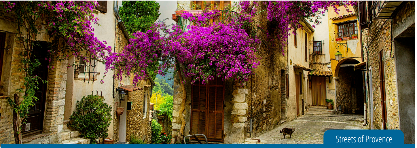
Streets of Provence