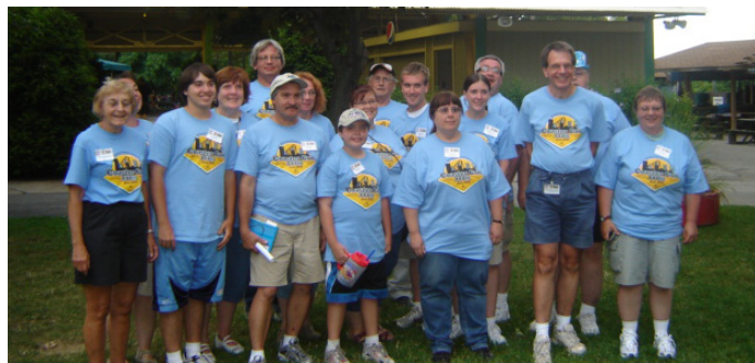
Coaster Con XXXIII promotional T-shirts

The navy blue shirts with the XX on the front were made to commemorate KennyKon XX, the 20th occurrence of ACE's longest running regional sponsored event. The first KennyKon was held in 1989 and has been held each year since with the exception of 1998 when Kennywood last hosted ACE's annual convention.