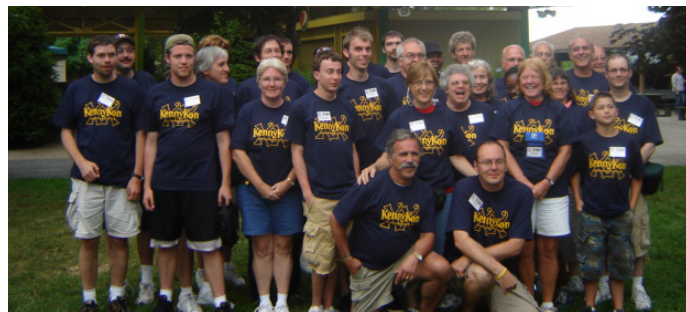
KennyKon XX commemorative T-shirts