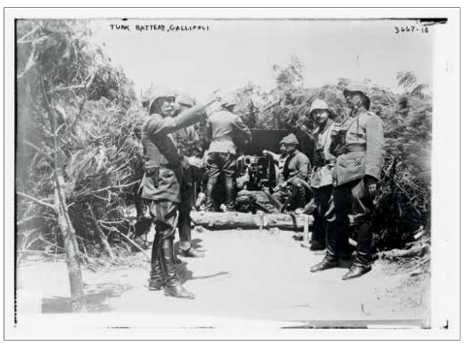
Ottoman soldiers and guns during Gallipoli campaign

handicapped Hamilton throughout the campaign, but was especially evident during the first, crucial days of the landing. Hamilton monitored the landing from aboard the Queen Elizabeth.... [However], the Queen Elizabeth was not configured as a headquarters for