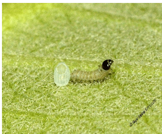
Monarch egg with newly hatched larvae

The second generation of Monarch butterflies is born in May and June, and then the third generation will be born in July and August. These Monarch