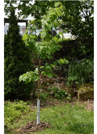
Redbud added this spring and thriving this summer.

The Ohio History Connection is a great place to visit year-round. Go tour the fabulous museum and the Ohio Village to enjoy the many exhibits that range from history to archeology to baseball to medicine. And be sure to spend a few peaceful moments enjoying to the beautiful bird viewing area where you will find seating and a large picture window. Check the website ( http://www.ohiohistory.org ) for events and hours. The Ohio History Connection has a great gift shop and wonderful collection of books for sale. Ohio History Connection, 1800 E. 17 th Avenue, Columbus, OH 43211. Phone: 800-686-6124.