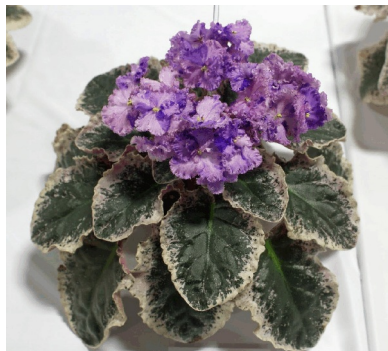
'Buckeye Love's Caress' grown by Belinda Thibideaux

Foliage should be kept as clean as possible and any water spots, soil, etc. should be cleaned off at once. Any suckers or side shoots should be removed as soon as they appear as they will distort the shape of the plant if allowed to remain even for a short period.