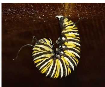
Larvae preparing to form chrysalis