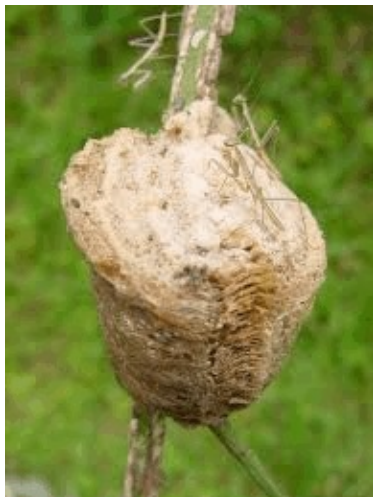
Praying Mantis Egg Case

beds, don't forget to look for a praying mantis egg case. You can tuck the twig it is on into a bush near where you would like them to go to work next spring.