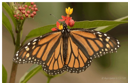
Adult Monarch Butterfly

butterflies will go through exactly the same four stage life cycle as the first generation did, dying two to six weeks after it becomes a beautiful Monarch butterfly.