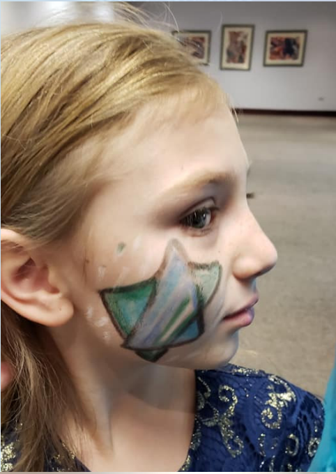
Temple Menorah Photo Booth