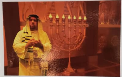
The Miracle of the Oil!