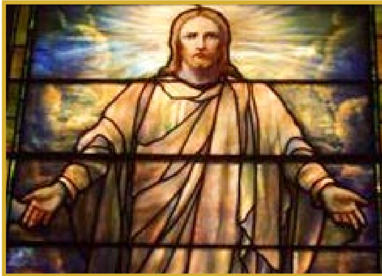
“wait for the revealing of our Lord Jesus Christ” stained-glass window at Brown Memorial Presbyterian, Baltimore