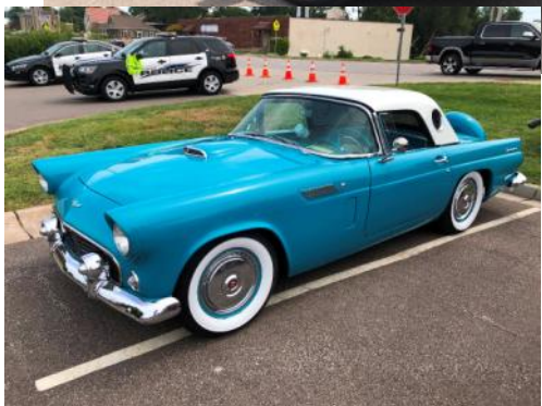
A Cygan ('56 T-Bird )imposter