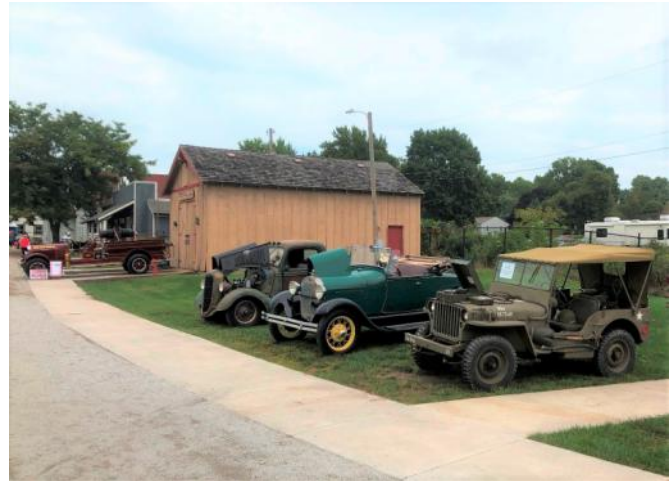
Main Street 1929