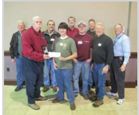
Keeping the shooting sports alive for the next generation is the goal of volunteers and junior shooters of South Cuyahoga Sportsman's Association. We are proud to support them!

A very special THANKS to our members for a fantastic January meeting. We welcomed 1,152 guests; we voted in 644 new members; we saw 760 tables; and an incredible 390 applied for membership. 4th highest on record. Please review the Applicant list.