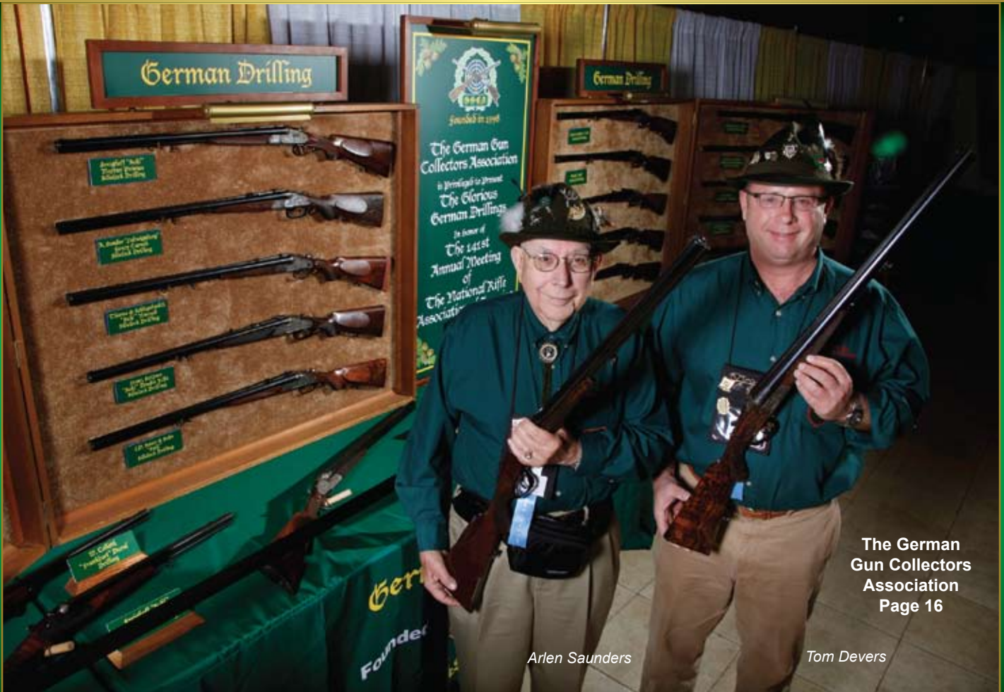
The German Gun Collectors Association Page 16