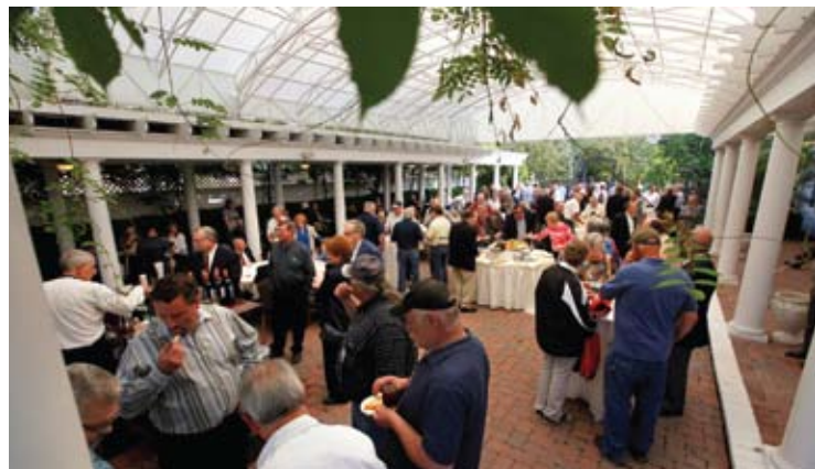
Cocktail hour on the beautiful patio of the Manor House at the 2012 Members Recognition Banquet.

Banquet tickets go on sale with this mailing and will also be available for sale at the March 23th - 24th meeting if seats remain. Only 500 seats are available