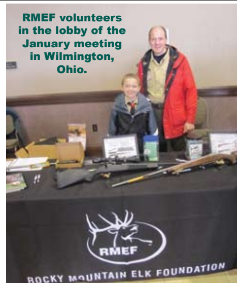
RMEF volunteers in the lobby of the January meeting in Wilmington, Ohio.