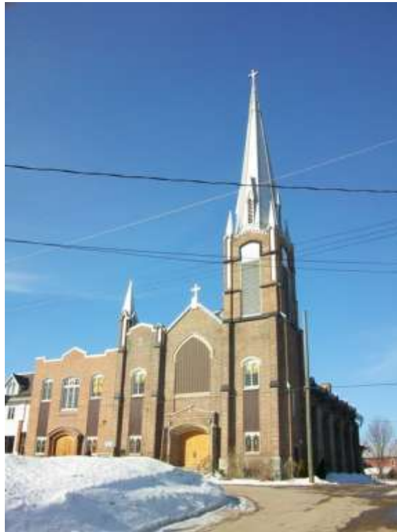
Saint John's Lutheran Church Pembroke, Ontario