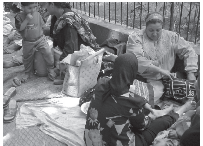
Families picnicking just outside the gates of the zoo during the holiday celebrating the end of Ramadan.

from other groups (real, without being isolated either, except for couples that are not officially engaged) is coordinated according to the requirement of finding a 'good place' (sunny or shady, dry or elevated surface, fairly near to the fountains, etc). On this small domestic perimeter of tablecloth, unfolded in a public space and refolded when one leaves, the celebrating Cairene families at the zoo manifest the signs of the pleasant and bucolic recreation of a picnic, despite possible intrusions. The mothers' and wives' first gesture is to remove their sandals or shoes, leaving them on the tablecloth. They remain barefoot through the afternoon, while regularly pulling at their dresses to avoid the immodesty of exhibiting their legs. With this space conquered, the husband can explore at a greater distance with the children, taking them to see the giraffe, for example, whose success with the children is guaranteed. Using its long black tongue, the giraffe knows how to snatch, without fault, the carrot that is extended to it amidst shouts of fright and laughter.