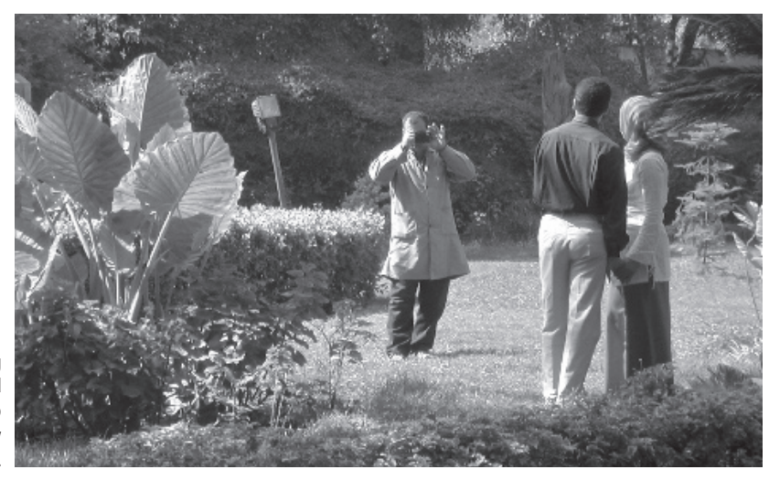
Couple being photographed and strolling in the zoo.

dark glasses for the photo!" One of the couples decides to pose farther away, where the sunlight of the end of the day pierces some foliage. The boy and the girl lean symmetrically on one of the park's floral lamps; the plants form the backdrop. The girl readjusts her blouse, smooths down her dress, straightens the pleats of her skirt and, finally, immobile, both of them look straight ahead at the camera lens. A little ill at ease, the boy only brightens his expression at the instant of the flash. The girl, gently smiling, seems defiant. Following the flash, the pose is kept a few seconds too long. Then all seem relieved.