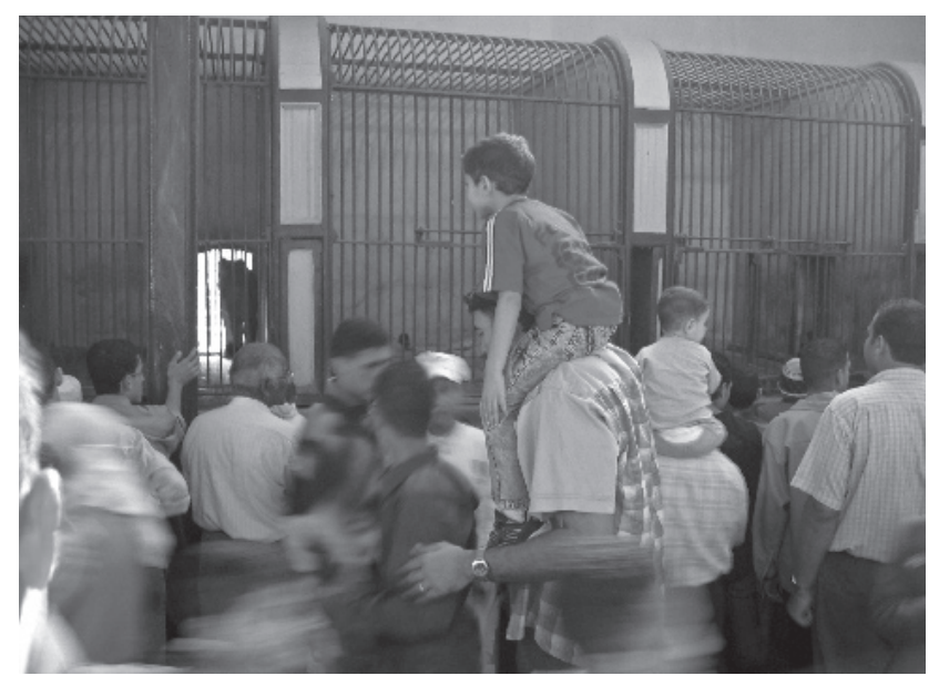
Visitors to the zoo view the caged animals (photograph by Vincent Battesti).

The zoo is usually a family destination. But during these few intense days, groups of youth and young couples swamp the families. However, families do not cede any territory; they bring their children with them, well dressed in their 'Id gifts, little suits for the boys and little white dresses for the girls or wearing a complete wardrobe sold under plastic in stores, with flowered hat included. In all cases, parents have taken great care to make sure that children appear in their finest attire, costumed as angelically and child-like as possible; whereas the adolescents proudly display their brand-name 'Id gift outfits (Nike, Levi's, Adidas, etc., almost always counterfeit) and the indispensable accessories of the season. One can guess that parents, without being in their 'Sunday best,' have made a vestimentary effort as well. For men, pants and shirt are preferred. The gallabiya (long shirt-like garment that reaches the floor) would be gauche. Women wear dresses carefully matched with their headscarves. Women of popular quarters are identified by the way they wear their scarf knotted at the neck rather than under the chin. The appearance remains a strong marker of greater or lesser social ascension. The families circulate among the animal cages, following the children's vague desires to see the animals or to consume—ice cream, another cola, tiger or lion makeup, or an inflatable balloon in the shape of a deer or a giraffe.