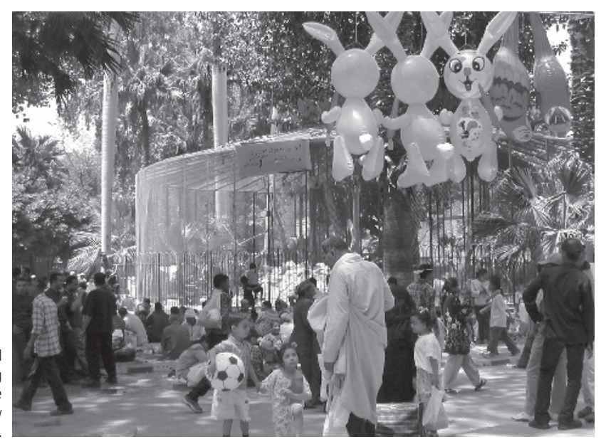
Families and children enjoying themselves at the zoo.

Families settle themselves on the numerous (but insufficient) benches, painted white and bottle-green, as well as in the spaces left open at the margins of the walkways. On this occasion especially, sitting on the grass is a liberty that visitors take, even against the interdictions posted on signs by the garden's administration. A tablecloth (a sheet, plastic mat, wool, or synthetic covering) performs several functions. The cloth is laid out and first, the woman—wife or mother—sits down and brings around her the children, the husband, sacks of provisions, plates, a music stand, the basket or package of food, and eventually, the football, the husband's shisha (water pipe), the stove for the tea, the children from other family groups. The density of the entire body renders the border between one family and the next almost unreadable. The tablecloth has an obvious function as a territorial marker whose integrity is more or less respected, particularly along the corridors between them. The other accessories are more mobile markers whose placement allows for negotiation with neighbors, expressed during the festival days through forms of courtesy and politeness: "Please, we'll make a place for you between us and our neighbors" (a space that the children already trample).