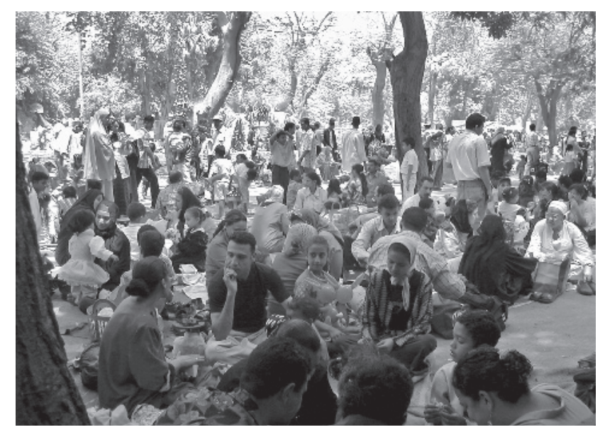
The crowds at the zoo during holidays.

about wandering in groups, invading the entire space given over to people, lingering; then suddenly agitated by a brusque change of regime, they run toward the larger crowd increasing its size. The object of these mobs is a fight breaking out, rather then an animal making a show, followed by nothing at all, a nonevent that fed upon the random attention of groups of visitors. The happy groups flow, occupying physical space to its smallest corners, attempting to penetrate the grottos, or spilling onto the forbidden lawns.