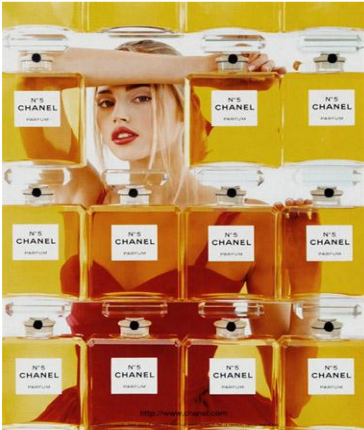
Estella Warren by Luc Besson 1998