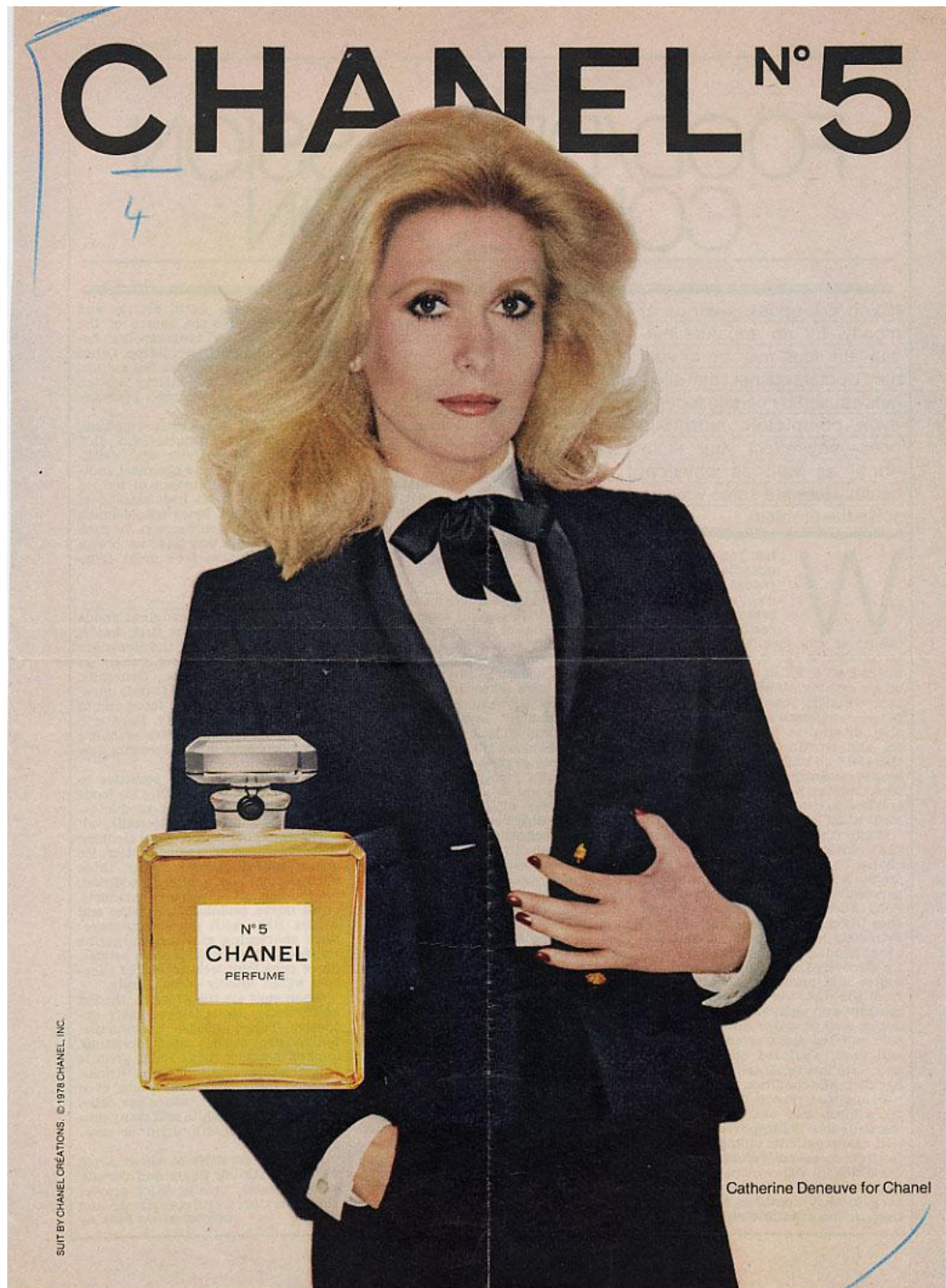
Catherine Deneuve by Richard Avedon 1978