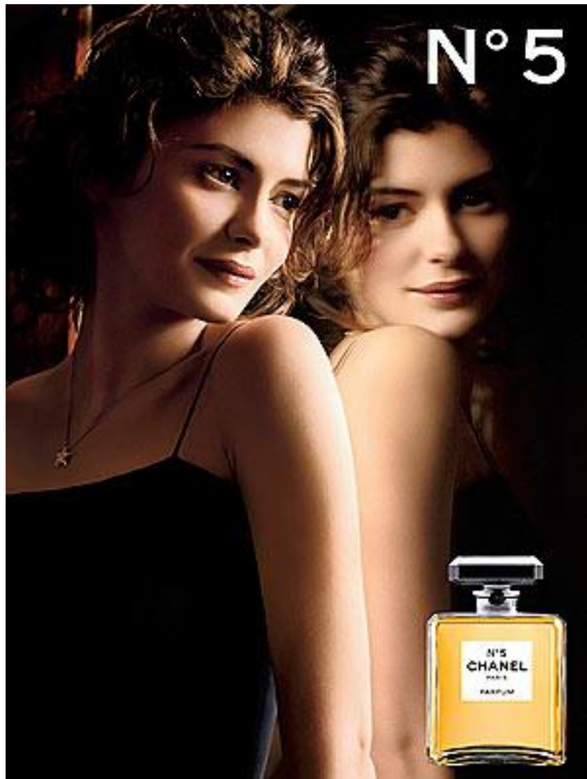
Audrey Tautou by Jean-Pierre Jeunet 2009