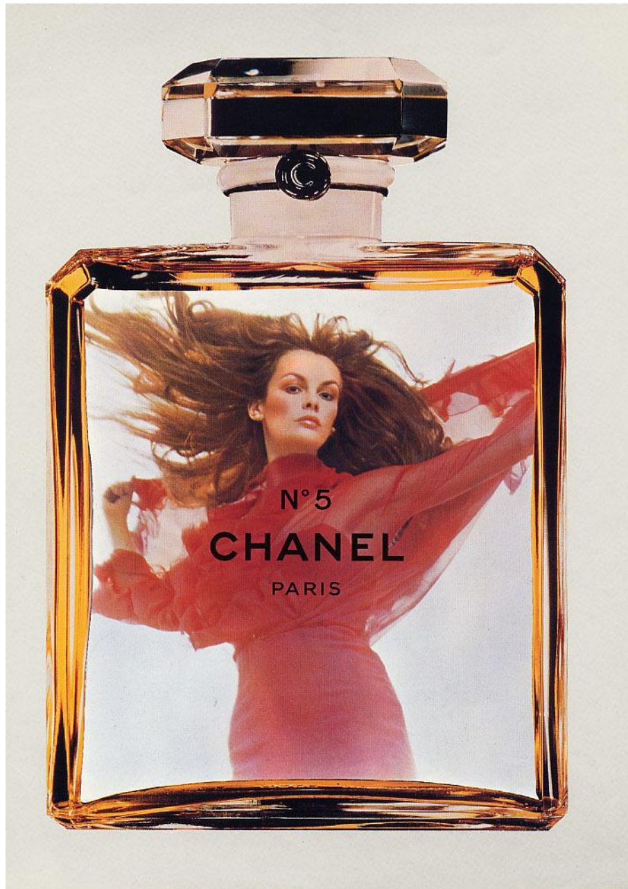
Jean Shrimpton by Helmut Newton 1969