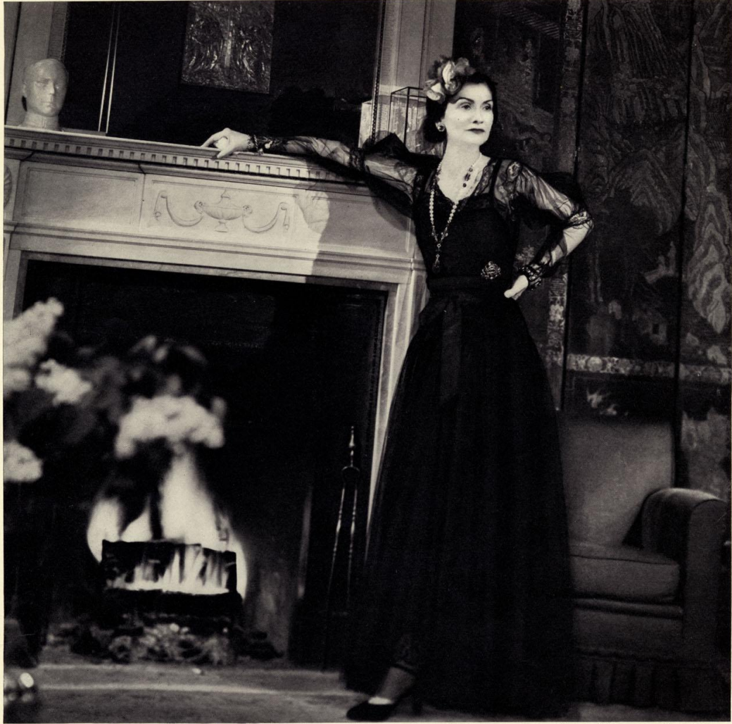
Madame Gabrielle Chanel in her new apartment in the Ritz, Paris