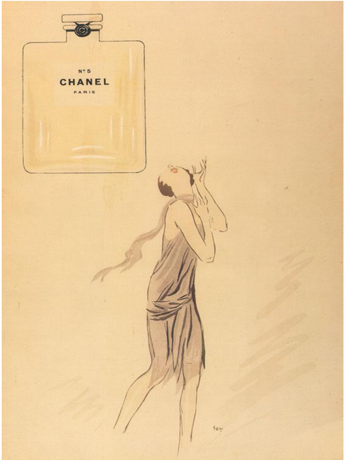
Sem's tribute to Chanel No. 5, 1921