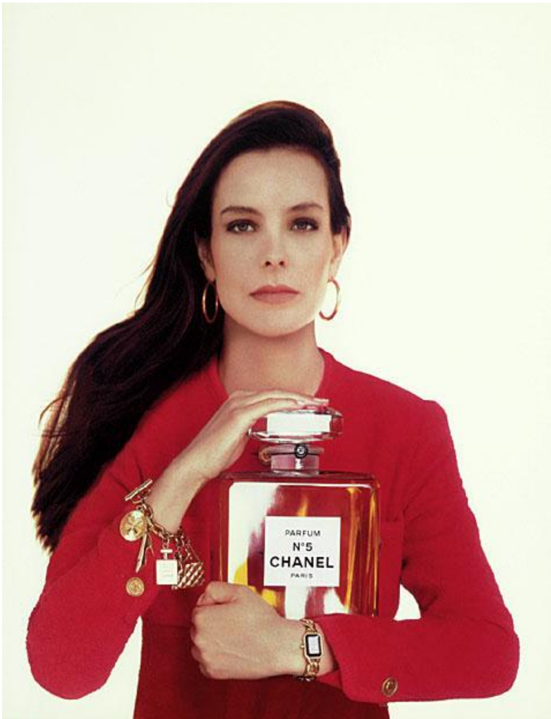
Carole Bouquet by Michel Comte 1987