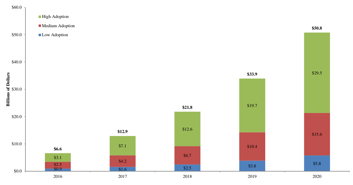
Figure 2 Conservative and Comparable Approaches Estimated Economic Impact of VR/AR Technology 2016 – 2020