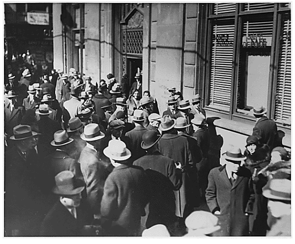
Worried depositors wait outside a bank hoping to withdraw their savings

While many investors lost their money in the market, many other people found their savings wiped out because banks had irresponsibly invested depositors' money in the market as well. Therefore, when the crash occurred banks also lost millions.