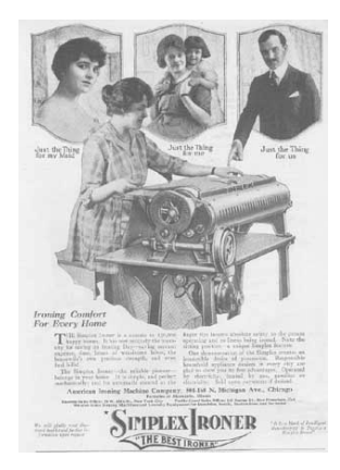
Many consumers in the 1920s bought items such as this ironer on credit