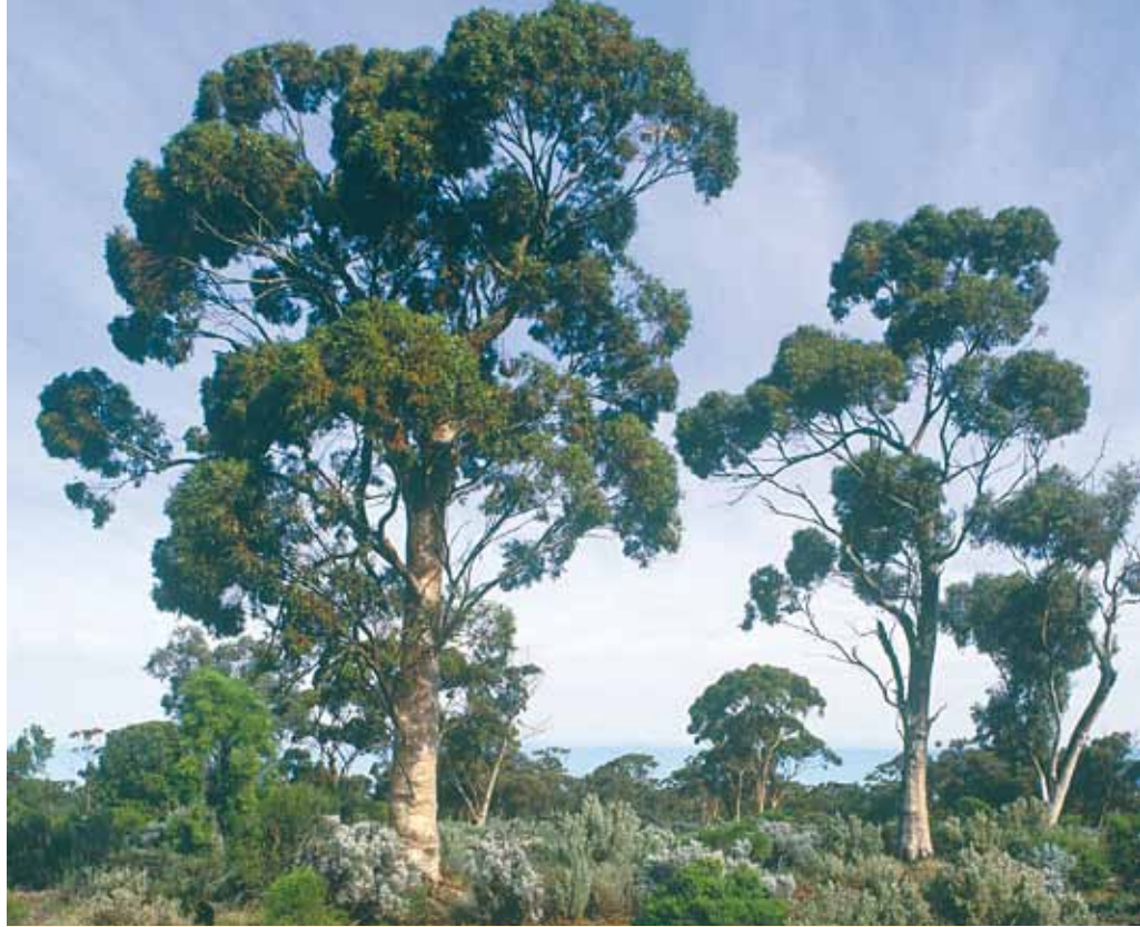
Above right Salmon gum woodland.