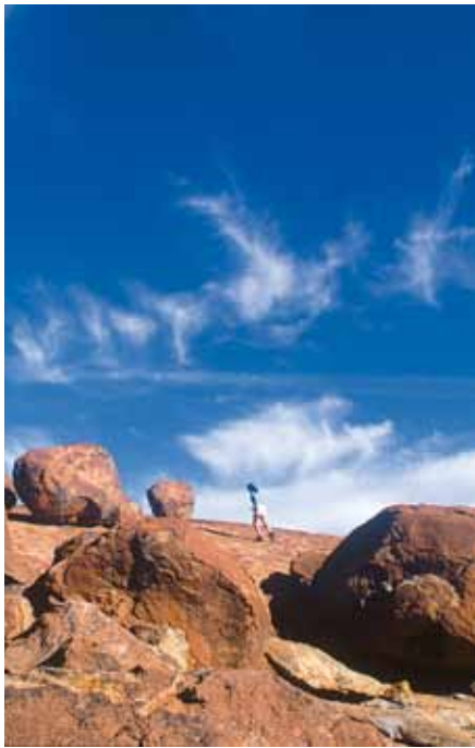
Above Victoria Rock.