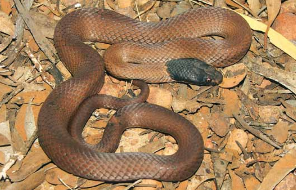
Left Lake Cronin snake.