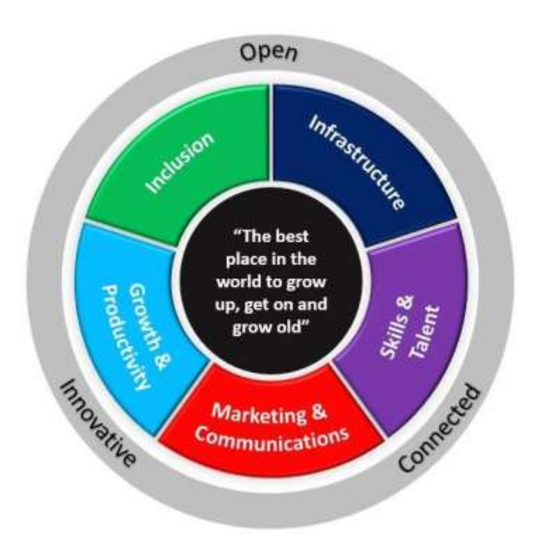
Figure 2. The GM Digital strategy.

Inherent within this approach is the recognition that Greater Manchester's success in this area is not in the gift of any individual or sector but can only be achieved through collaboration. In addition, this approach is engaging some of the best minds available in the city region and is strengthening the city region's networks, creating conditions which evidence suggests engender further innovation.