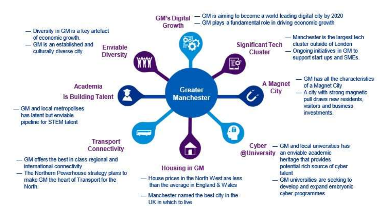
Figure 1. The GM digital ecosystem overview.

This strategy and its Action Plan aim to build on this base and at the same time address identified challenges.