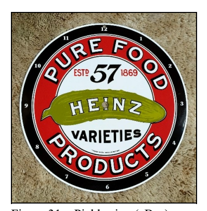
Figure 31 – Pickle sign (eBay)

commissioned numerous pins and pendants made of metal and plastic. The pickle was used on numerous labels, typical signs, and was embossed on at least one bottle enclosing the word "HEINZ" (Figures 30 & 31; also see Figure 22).