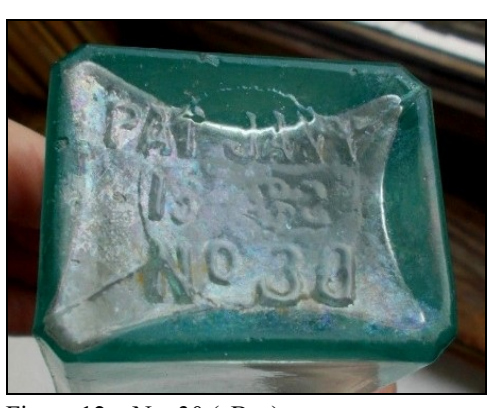
Figure 12 - No. 30 (eBay)