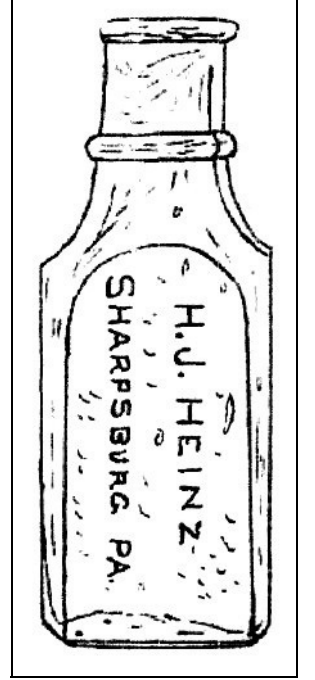
Figure 2 – Early Heinz bottle (Eastin 1965:34)

According to Toulouse (1971:236), Heinz used this mark during