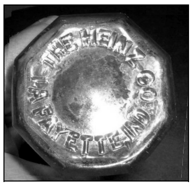
Figure 34 – The Heinz Co. base

An octagonal catsup bottle offered on eBay was embossed on the base "THE HEINZ CO. (arch) / LAFAYTTE, IND. (inverted arch)" (Figures 34 & 35). Although not clearly stated, the bottle appears to have been mouth blown – as would fit the probably date range for the firm. Caniff (2011:42-43) illustrated and discussed a "light-bulb-shaped jar"