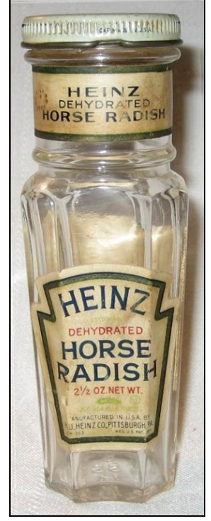
Figure 16 – Hazel-Atlas bottle

Typical of Owens bases, both the scar and the "circle" were off center even though the number was in the middle of the bases in all of the examples we have found (Figure 18). This unusual scar combination is the only truly reliable method we can find to identify bottles produced at the actual Heinz plant.