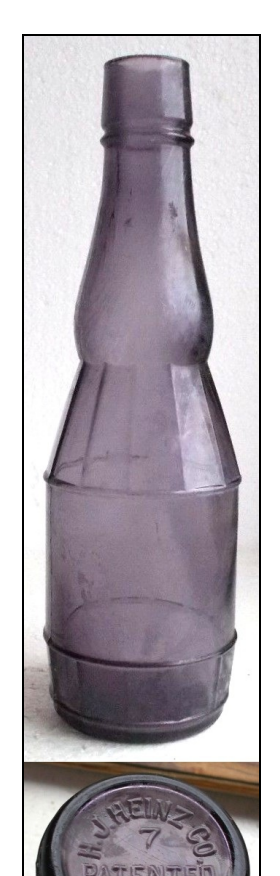
Figure 26 – H.J.Heinz (eBay)

"HEINZ" basemark does not necessarily indicate a manufacture by the Heinz glass plant.