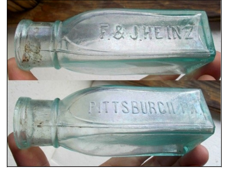
Figure 11 – F&J Heinz (eBay)

10). A pickle bottle with the same side embossing was embossed "PAT JANY / 16 (figures illegible) 82 / N<sup>o</sup> 30" (Figures 11 & 12).