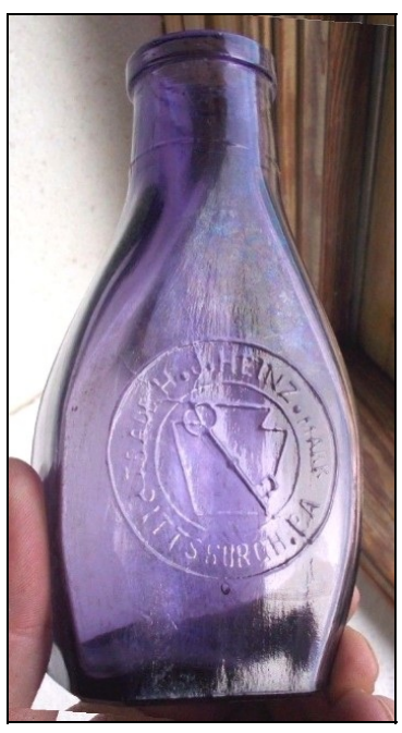
Figure 25 – H.J. Heinz – side

illustrated with a key superimposed atop a keystone) from ca. 1876 to 1880