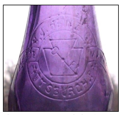
Figure 29 – Keystone design (eBay)

(Figures 29; also see Figure 25). These keystone designs were almost always embossed on the shoulders of bottles and could include the superimposed key or just the keystone. In