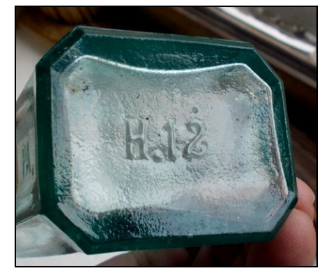
Figure 10 – H.12

several examples of H.&J. Heinz bottles – all rectangular in shape with chamfered corners and sunken side panels. These aqua bottles were embossed "F&J HEINZ" on one side panel and "PITTSBURGH" on the other. Each was mouth blown with a rounded, single-ring finish. Bottles base-embossed "H10" had ridged shoulder panels, while the shoulder panels of bottles with "H.12" basemarks were flat (Figures 7-