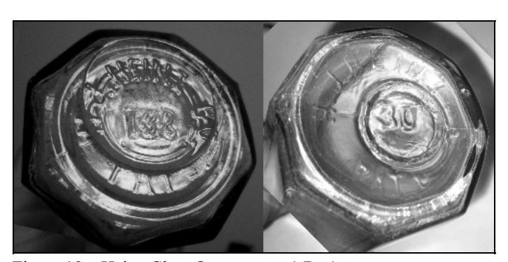
Figure 18 – Heinz Glass Owens scars (eBay)

a circle. Toulouse (1971:236) misdiagnosed these as the "typical Heinz numbering" system consisting of a number in a circle.