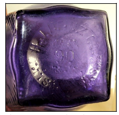
Figure 23 – H.J. Heinz – base (eBay)