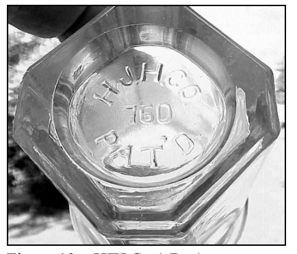
Figure 19 – HJH Co (eBay)

"held peanut butter and also jelly. Sealed with a decorative pry-off lid." The mark is very uncommon, and the jar was probably used during the late 1920s-1930s time period. The finish was probably for the Vacuum Cap, made by the Vacuum Cap Co. in 1928