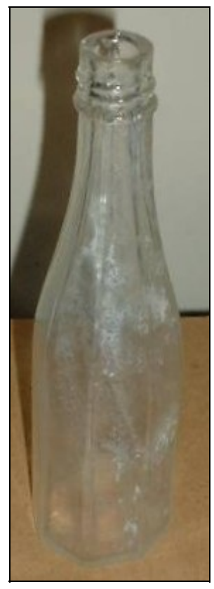
Figure 35 – The Heinz Co. bottle