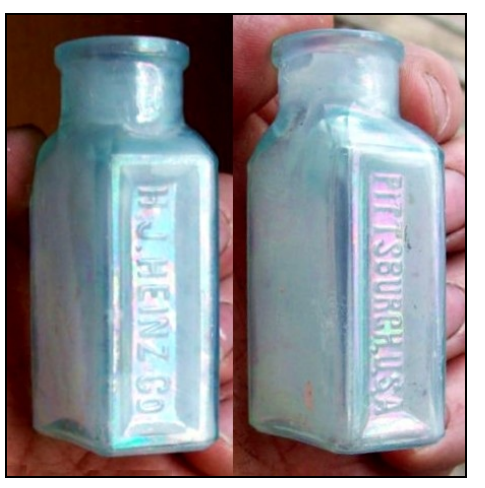
Figure 28 – H.J.Heinz

(Figures 29; also see Figure 25). These keystone designs were almost always embossed on the shoulders of bottles and could include the superimposed key or just the keystone. In