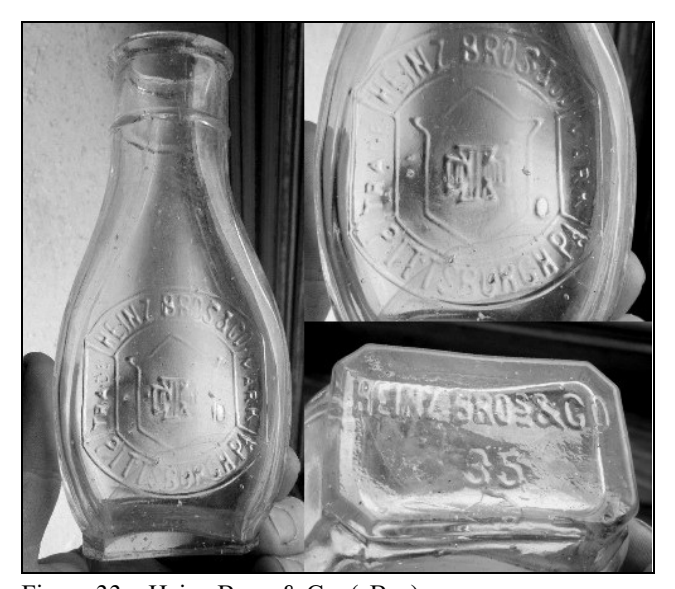
Figure 33 – Heinz Bros. & Co.