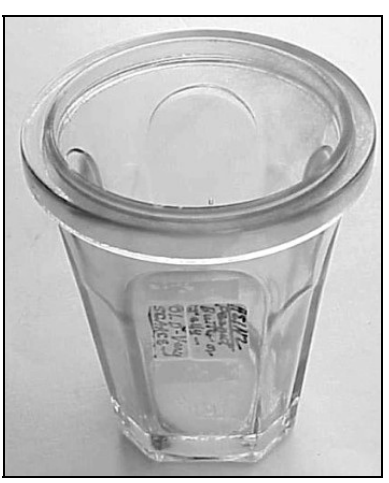
Figure 20 – HJH Co jar (eBay)

and "H.J. HEINZ CO." and were made with at least three basal variations (Zumwalt 1980:205). Most of the numbers between 17 and 33 were accompanied by "HEINZ" – although some were marked "H.J. HEINZ CO." (Zumwalt 1980:205-210). As shown on bottles offered at eBay auctions, the word "HEINZ" alone was embossed on sides as well as bases of bottles – although often,