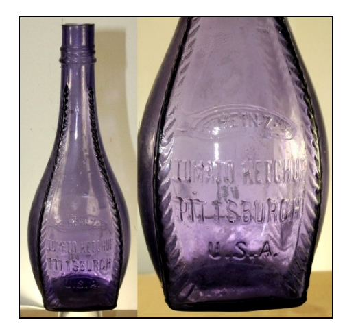
Figure 22 – Heinz – side

Toulouse (1971:236) noted that Heinz used this simple version of his name "after 1888 when little bottle space was available." The actual use seems to have no relationship to space. Pickle bottles with the number "7" were embossed both "HEINZ"