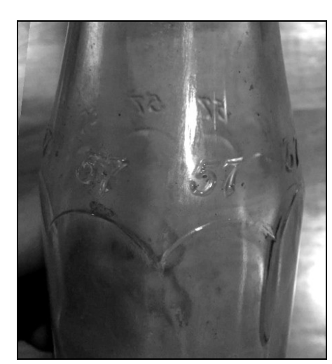
Figure 32 - 57 bottle

Heinz limited the use of "57 Varieties" a century later, in 1969. At that time, the company made ca. 1,250 different "varieties" and had acquired other companies and brand names (see Figure 31). In keeping with its new, larger identity, the company needed a broader advertising unit (Alberts 1973:265-266).