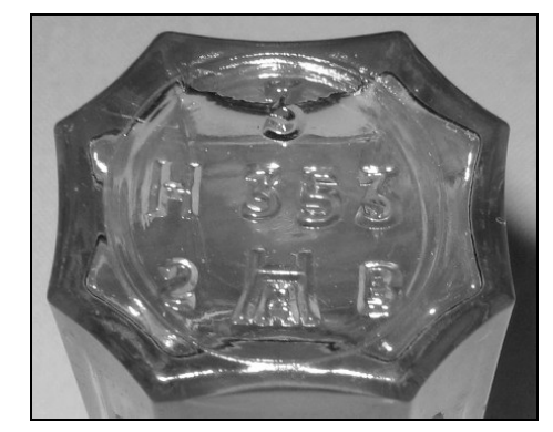
Figure 15 – Hazel-Atlas base

for the company. Owens made bottles with numbers at least as low as 57 (made 1895-1910), a very popular bottle with at least seven basal variations (Figure 14). Illinois-Pacific made numbers as low as number 162 (1918-1923), and Hazel-Atlas was involved by bottle 211 (1924-1927) (Zumwalt 1980:212-213, 225, 228 – Figures 15 & 16). The Owens-Illinois mark is found by at least number 213 (1922-1943). In 1990, Heinz developed a recyclable plastic ketchup<sup>5</sup> bottle (Foster & Kennedy 2006:94). The days of glass were over.