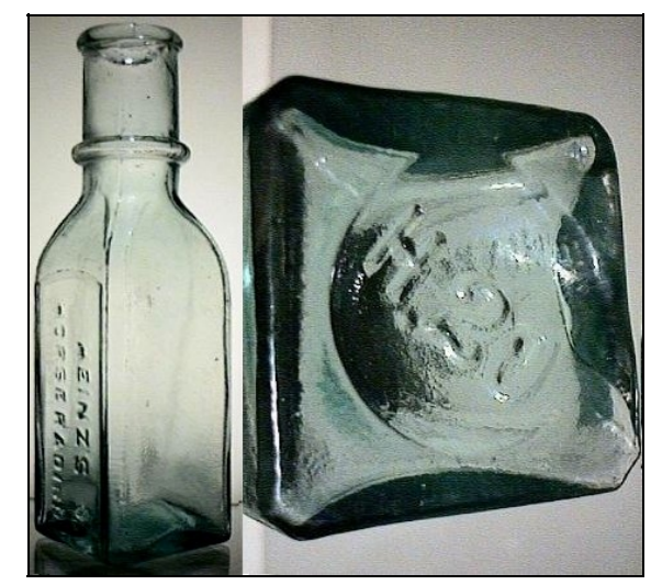
Figure 13 – Heinz's

A very few bottles were embossed "HEINZ'S" on the sides (e.g., HEINZ'S / HORSERADISH – Figure 13). These bottles are early designs and mouth blown, so they may be from this period. Even though the base was embossed "H20," the number does not match the design #20 in the Heinz list (see below). The Heinz #20 was machine made in 1910; this is obviously a much earlier bottle.