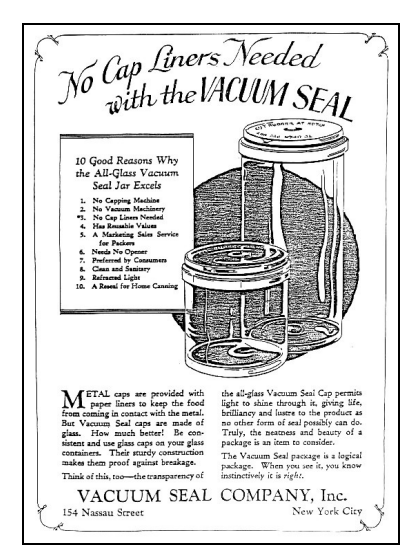
Figure 21 – Vacuum seal (Bender 1986:21)