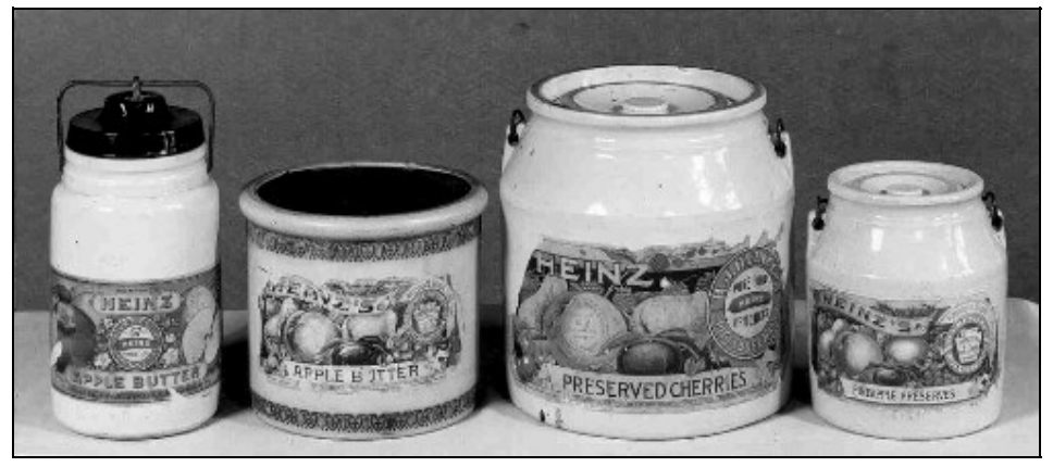
Figure 17 – Ceramic containers (Henry Searcy collection)

We have not discovered any mark specific to the H.J. Heinz Glass Co. However, the individual Owens machines used by the Heinz factory seem to have left somewhat unusual Owens scars. Along with the typical feathered scar, there seems to have been a buildup of glass in