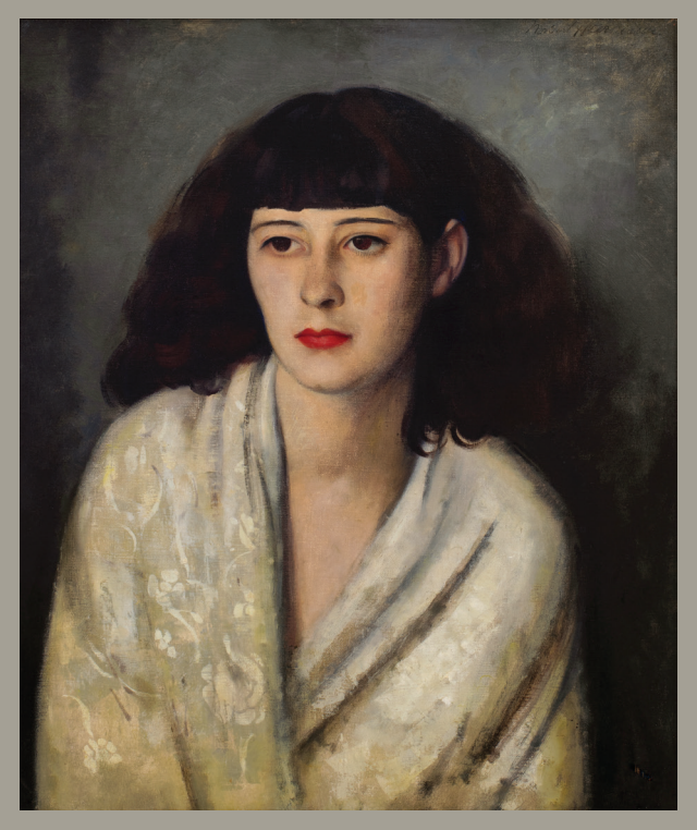
Norbert Heermann (American, born Germany, 1891–1966) Lady with Red Lips , c. 1940 Oil on canvas