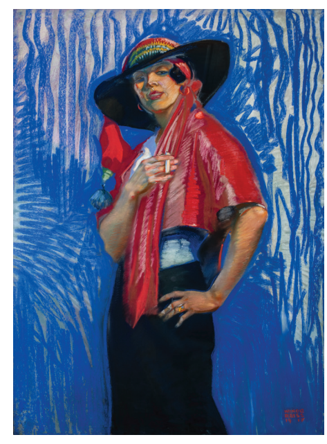
Winold Reiss (American, born Germany, 1886–1953) Woman in Black Hat with Cigarette, 1917 Pastel on paper

Artists of all stylistic bents came together to establish the Woodstock Artists Association in 1919, a muchneeded venue for exhibitions that remains active today as the Woodstock Artists Association and Museum.