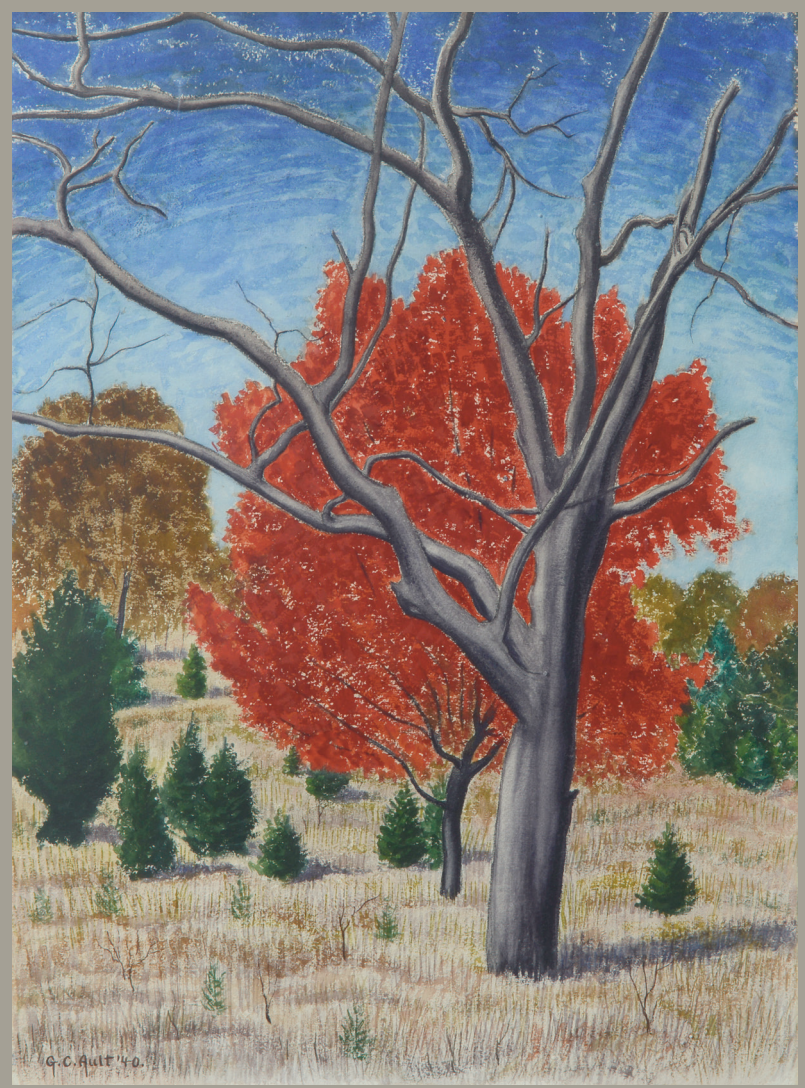
George Ault (American, 1891–1948). Autumn Hillside, 1940, Gouache on paper