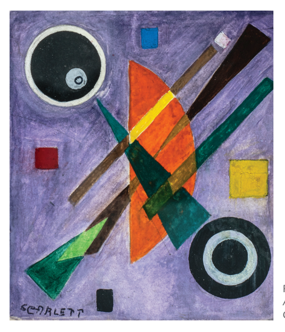
Rolph Scarlett (American, born Canada, 1889–1984) Abstract Composition, c. 1940 Gouache on paper

After World War II a new generation of artists arrived in Woodstock, joining those already established there. Along with the continued success of the earlier institutions, the return of the Art Students League Summer School (1947–1979) and annual events such as the Woodstock Art Conference (1947–1952) ensured the enduring vitality of the colony into the late 20th century to today.