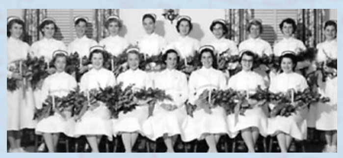
The Gordon Keller School of Nursing is transferred to Hillsborough Community College.