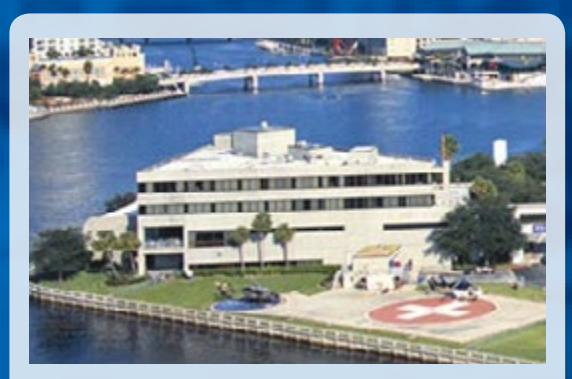
TGH opens a 59-bed rehabilitation center connected to the main hospital by a pedestrian bridge.