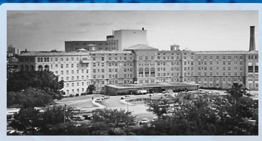
A two-story addition, housing obstetrics and an intensive care unit, is added to TGH.