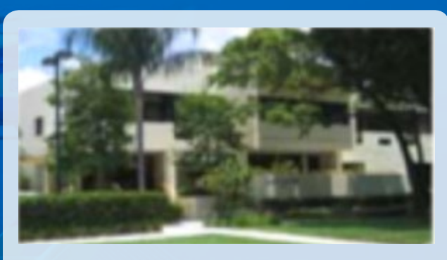
The Suncoast Ronald McDonald house becomes Tampa General's neighbor.

The HCHA rejects an attempt to convert Tampa General Hospital from a public to a private, not-for-profit corporation.