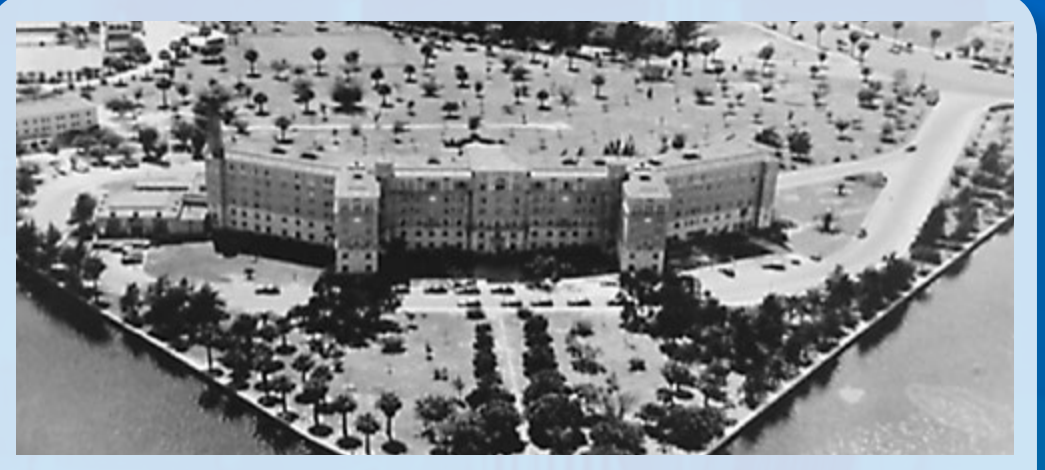
An expansion of Tampa General Hospital results in growth to 514 beds.

TGH's governing board changes its name to the Hospital and Welfare Board of Hillsborough County.