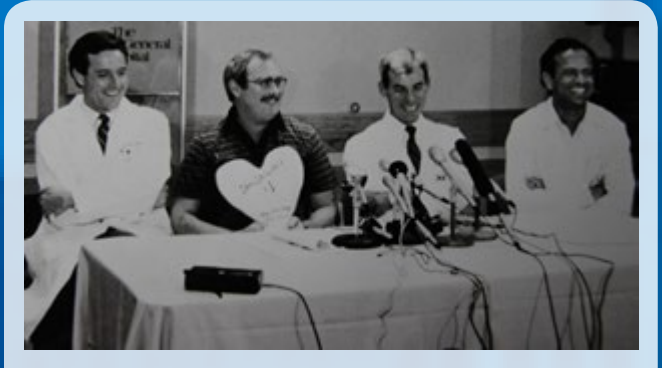
The first successful heart transplant in Florida is performed at TGH.