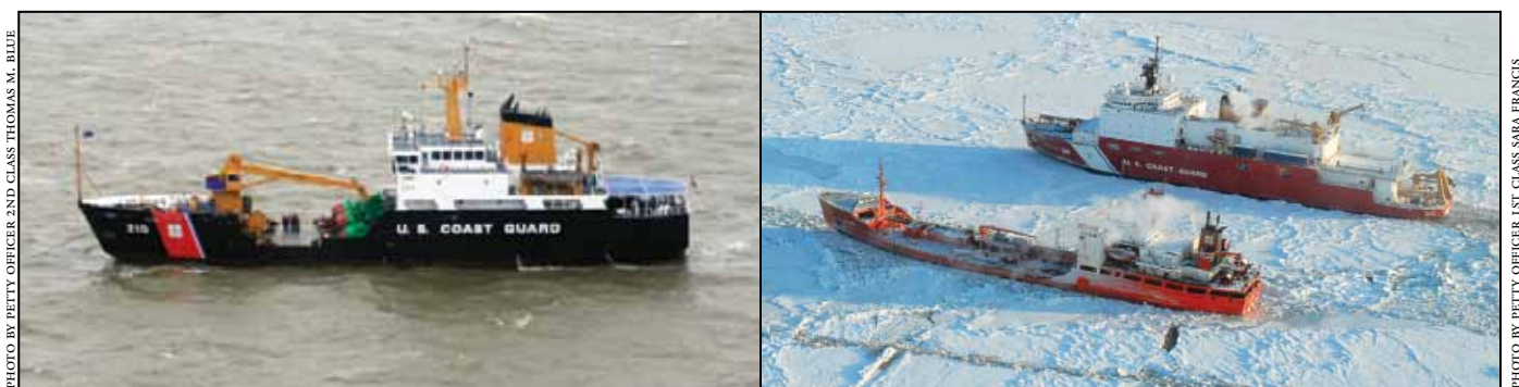
SEA HISTORY 139, SUMMER 2012

(left) USCGC Cypress, a 225-foot buoy tender, out of Mobile, Alabama, in 2009; (right) USCGC Healy breaks ice around the Russian-flagged tanker Renda, 250 miles south of Nome, Alaska, in January 2012.