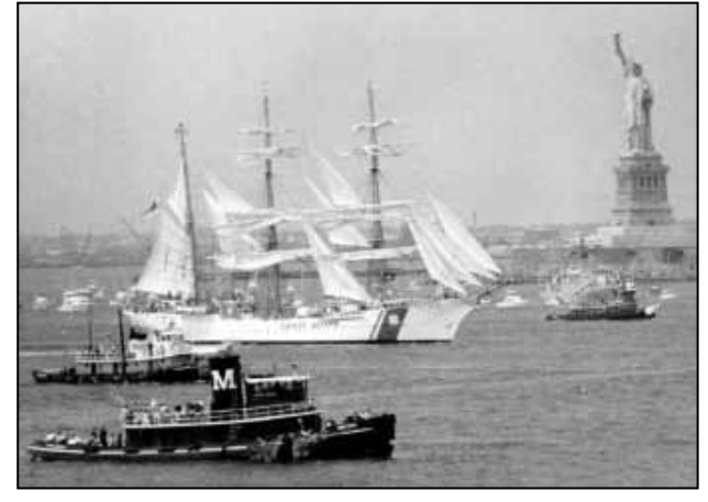
The Eagle debuted her new racing stripe during OpSail '76.

Since the 1970s, the Coast Guard Racing Stripe and color scheme has been applied even to assets not commonly associated with the service. With alterations in coloration and angle, the Racing Stripe has become a symbol for sea service vessels at the federal, state, county, and municipal levels throughout the US and for scores of foreign sea services.