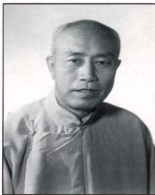
像 者 著

As the Chen Style spawned the Yang style, all subsequent styles owe their origins directly or indirectly to Yang influence....especially Master Yang Chang-fu...who's fame and renown spread far and wide throughout China during the early part of the 20 th century. This is a rare photo of all these Tai Chi Masters...sitting together in 1929.