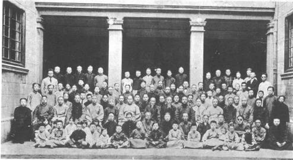
1. Yang Ch'eng-fu 3. Sun Lu-t'ang 2. Yang Shao-hou 4. Wu Chien-ch'ian

Grand Master Yang Cheng-fu, though an imposing figure of 300 pounds in his later years, was good natured and popular with students of which he had many. So great was Cheng-fu's prestige, that the Governor of Canton offered him 800 silver dollars a month to come south and teach the Grand Art of Tai Chi Chuan! And even the Imperial generals humbled themselves before him!