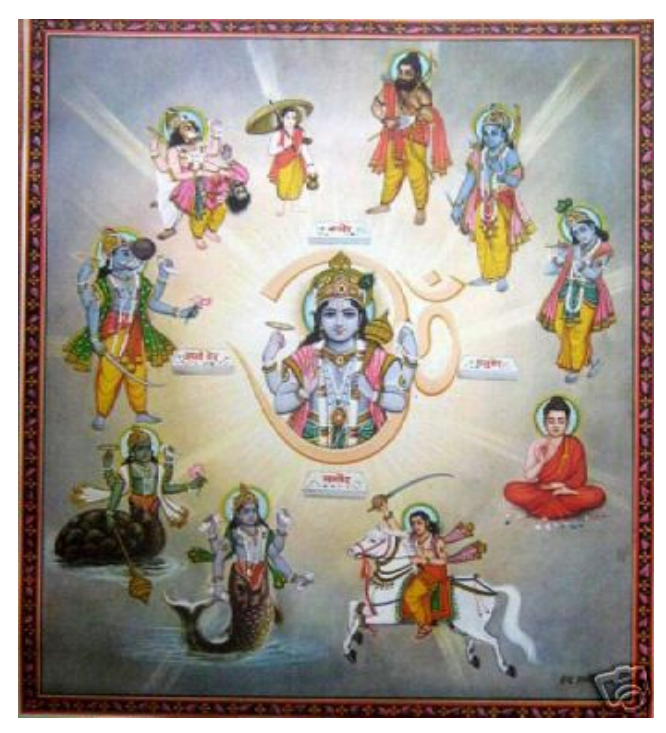
Figure 1. The Avatars of Vishnu

Different traditions and religions have different names for the masters and Avatars. The Hindu pantheon of Avatars of Vishnu<sup>5</sup> shows divine Teachers of humanity from early Lemurian times to the Coming One known as the Kalki Avatar (the Rider on the White Horse). Figure 1 shows a selection of ten of