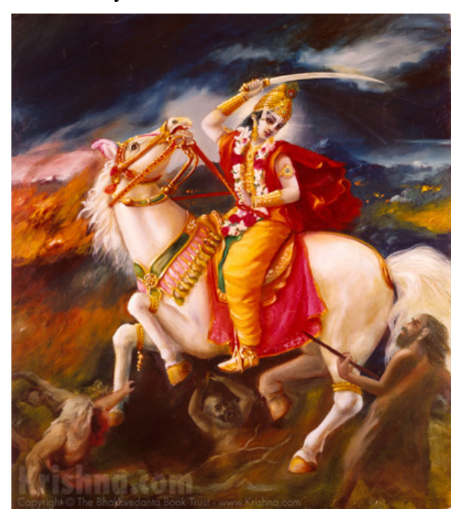
Figure 2. The Kalki Avatar

The Buddhists have an Avatar for each root race, and others, and also a hierarchy of celestial Buddhas, with Avalokiteshvara being the Logos of all Buddhas. According to Blavatsky the Maitreya is their 5<sup>th</sup> Buddha, and is also the Messiah, and the Kalki Avatar of the Hindus.<sup>8</sup> While it is apparent that different religions have different names for the same spiritual offices in the higher kingdoms, it is not always known that the Kalki Avatar will be the Avatar of the Being known variously as Vishnu, Christ, Bodhisattva, and Maitreya (all the same), and that this Avatar can also be the incarnate agent of the Avatar of Synthesis.