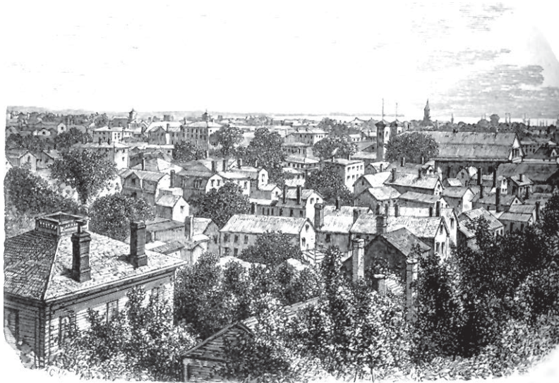
The Town of Salem

There were over 600 people who lived in Salem in the Massachusetts Bay Colony. Some of the people were fairly wealthy. They were merchants and businessmen who made their money from trade. Most of these families lived in the eastern section of the town near Massachusetts Bay. The other families made their living from farming and lived in the western section a few miles away. The farmers, led by the Putnam family, wanted to separate from Salem and formed a new community named Salem Village (years later the name was changed to Danvers). They believed that the wealthy people of Salem were more concerned about themselves and making money than about their Puritan religious beliefs.