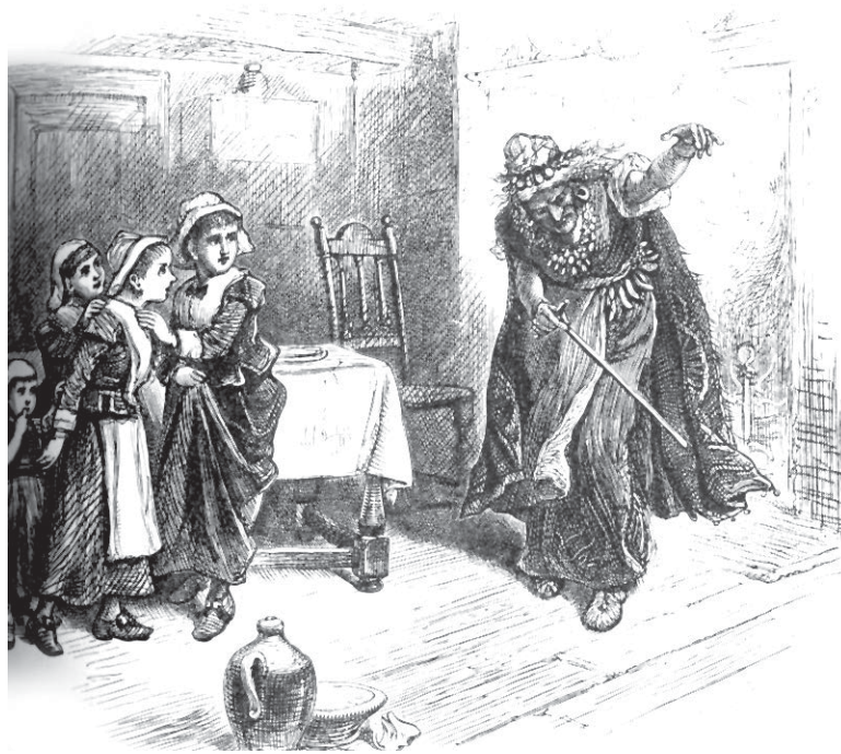
Tibuta and the children

The witchcraft trials were to be held at a local tavern but when so many people showed up to witness the trial it was moved to the Salem Village Meeting House.