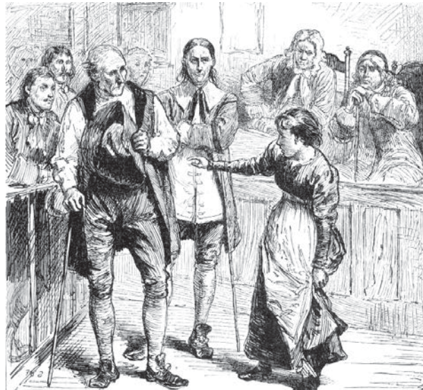
Giles Corey in Court

Giles Corey, a man in his 80s, and his wife were both charged with being witches. Giles, like John Proctor, had criticized the trials. When he was ordered to court, he refused to stand trial. He believed that if he refused to be tried his land would not be taken from him and could go to his two sons-in-law. For refusing to stand trial he was ordered to be pressed to death under heavy stones. Giles was held in chains in jail for five months before being killed. His wife, Martha, was known as being a very religious person. She did not believe in witchcraft and was against the trials from the very beginning. She was found guilty based on testimony that her spirit had attacked the girls that testified against witches.