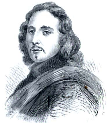
Henry Vane Governor of Massachusetts Bay Colony, 1636

Narrator 1 Anne's brother-in-law, John Wheelwright, was a Puritan minister. He was one of Anne's loyal supporters. Other Puritan ministers in the colony opposed some of the teachings of Rev. Wheelwright. He was called before Puritan ministers in the colony and ordered to stop preaching. The governor of the colony, Henry Vane, one of Anne Hutchinson's admirers, came to John Wheelwright's defense.