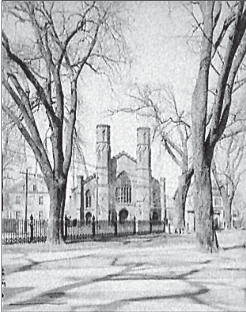
East Church (In 1901 as the Salem Witch Museum)

ing a child and the judges ruled that she should first give birth before carrying out the death sentence. By the time the child was born the trials had ended and Elizabeth was released from jail. Although pardoned, she was not permitted to claim any of her husband's property. Giles Corey was pressed to death for refusing to stand trial and two days later his wife was hung.