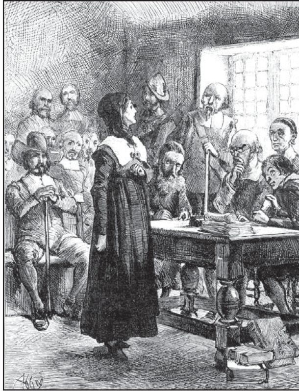
Trial of Mrs. Hutchinson