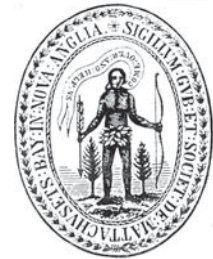
Seal of the Massachusetts Bay Colony

Anne Hutchinson Will, what a pleasure it will be to raise our children in this great "City Upon a Hill" where everyone treats others fairly. We can all worship God in peace.