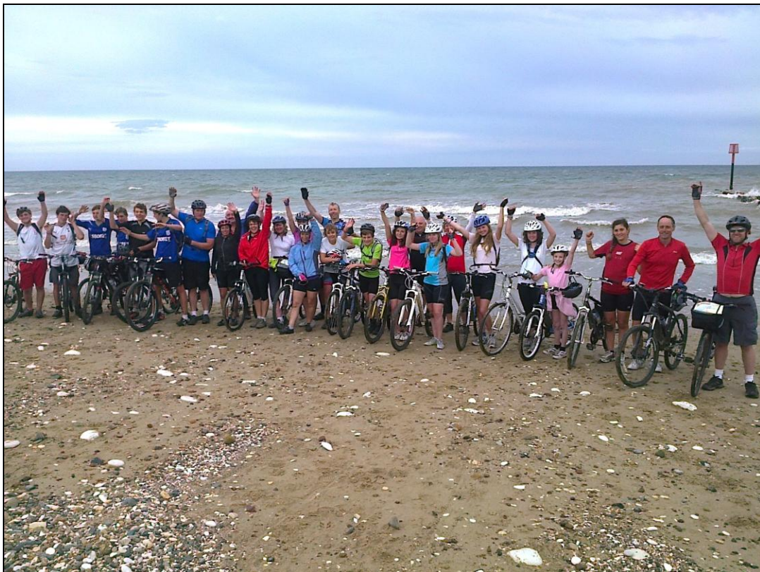
A group of the riders many of whom were new to cycling – on the beach at Bridlington