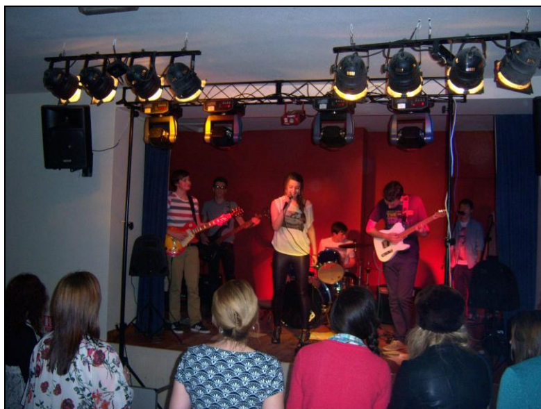
HTT (aka ‘Hiding from Olive’) in action on 27 th January

A group of Huw’s friends got together late in Autumn 2011 and performed in public for the first time in January 2012 in front of over 100 people, giving the proceeds to Huw’s Trust. They have since played at the Picturedrome (see below) and on a number of other occasions. To be honest, they are excellent and despite spreading their wings, they still make contributions to the Trust when they perform – which means a lot to us.