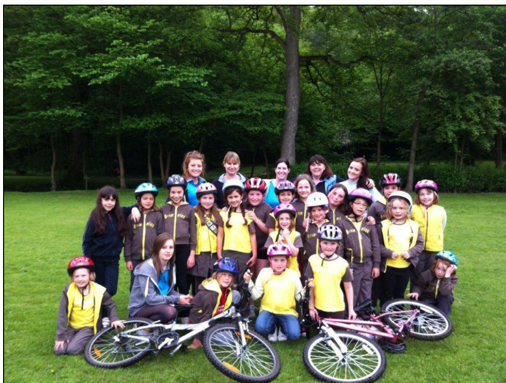
Young cyclists from 1 st Upperthong Brownies in May 2012