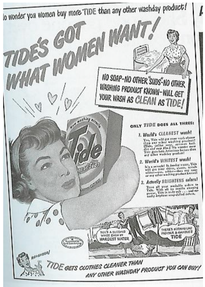
Family Circle, 1955

Based on their research, Courtney and Lockeretz concluded there were four stereotypes underlying the ideal woman portrayed in magazine advertisements; significantly, their analysis revealed a common emphasis on projecting male superiority and feminine domesticity. The first stereotype held that a woman's place is in the home with her family: "Motherhood and the care of the home and husband are the ultimate goals of a woman's life and her greatest creative opportunity." This was reflected in the consumerism of such products as cooking and cleaning aids. It was not uncommon for such advertisements to insinuate (at times rather explicitly) that "a good wife and mother would buy this," or "a good wife would want to protect her family."