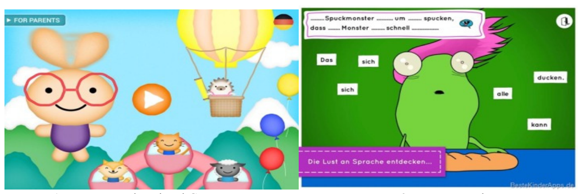
1. Language Educational Game

Today in Germany there are so-called "Kinder Apps Sprchen and Sprachen lernen", which provides children and parents with the help of smart apps, gadgets and educational programs on Tablets (even if children are surrounded by them) with children's swords and exercises to learn to properly pronounce certain phonemes, words and wholesome sentences in German. Some of them are known: Eli Explorer – 1. "Sprach-Lernspiel App für kleine Kinder" (iPad, iPhone); 2. "Monsters behave! – Sprachspiel App mit lustigen Monstern für Kinder ab 4 Jahre"; 3. "Dein illustriertes Wörterbuch – Kinder App zum Fremdsprachen Kennenlernen"; and 4. "Happi Wörter – Eine Wort Assoziationsspiel App für Kinder, iPad iPhone..."