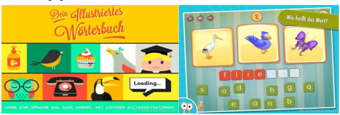
3. Your Illustrated Dictionary