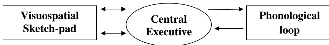
Figure 1. Working Memory Model.

a store that holds memory traces for a couple of seconds, combined with a sub-vocal rehearsal process” (Baddeley, Kopelman, & Wilson, 2004, p. 3). The sub-vocal rehearsal process is also referred to as sub-vocalization, which is the use of inner speech for rehearsing items in order to recall the information (Baddeley, 2006, p. 6). Lastly, the visuospatial sketchpad includes the storage of information and the visual and spatial manipulation of it (p. 4). Baddeley (2006) suggested that the sketchpad parallels the phonological loop but is not so easy to study (p. 13). He also aide the sketchpad “does not have a rich and standardized set of stimuli,” but plays a vital role in obtaining visual and spatial information about the world (p. 13). For example, information that enters the brain goes into the central-executive part, is stored in the phonological loop, and heads back to the central executive area. In the visuospatial sketch-pad, this information is manipulated to produce a product that goes back to the central-executive part of the brain.