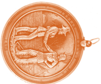
Treaty 6 Medal

Red River colonists greeted by Chief Peguis in 1821.