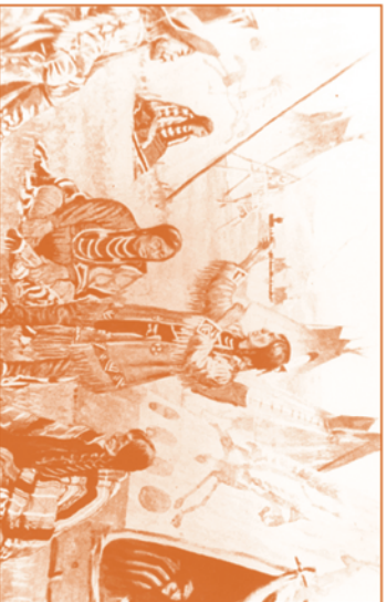
"An Indian Encampment"