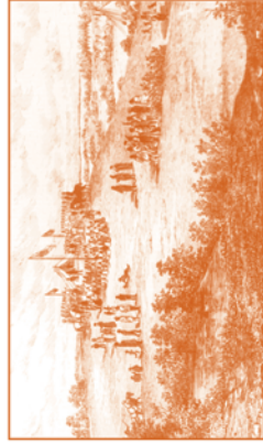
Treaty 6 negotiations in 1876.