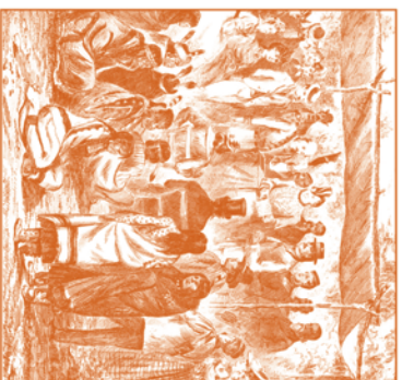
Treaty Council in Manitoba