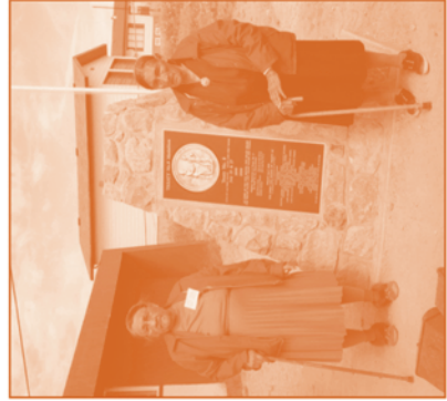
Treaty 8 Elders unveil a commemorative plaque at the 100th anniversary of Treaty 8 at Fond du Lac

TREATY 8 is concluded at Fond du Lac on June 21