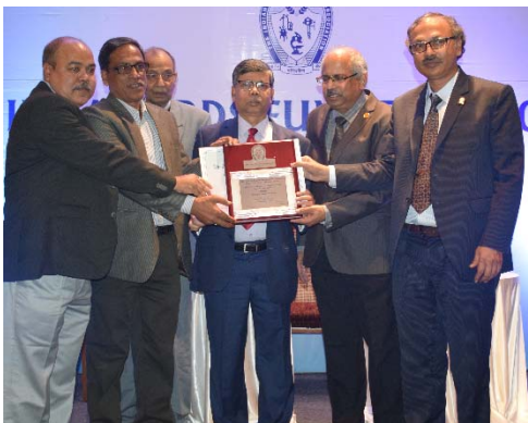
IPA Bengal State Branch receiving the Outstanding State Branch award 2017