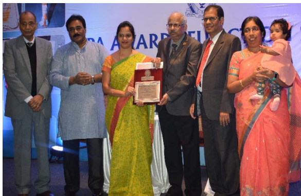
IPA Rajahmundry Local Branch receiving the Outstanding Local Branch award 2017