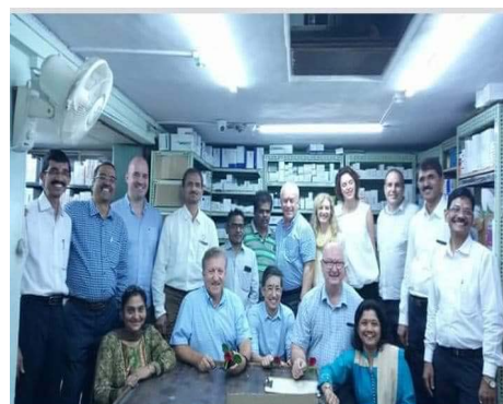
Visits to Community and Wholesale Pharmacy in Navi Mumbai by CPS team