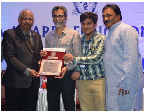
IPA Peenya Local Branch receiving the Outstanding Local Branch award 2017