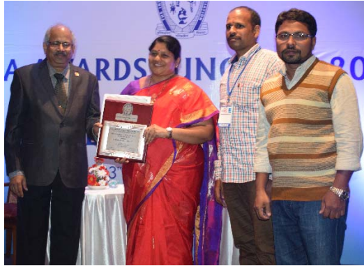
IPA Enikepadu Local Branch receiving the Outstanding Local Branch award 2017

The IPA Bengal & Maharashtra State Branches received the Outstanding State Branch Awards and the Outstanding Local Branch awards were bagged by the Peenya, Rajahmundry and Enikepadu Local Branches for the year 2017, respectively.