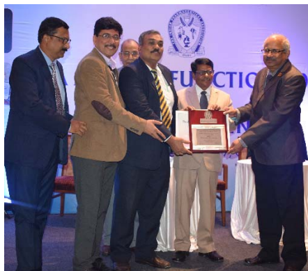
IPA Maharashtra State Branch receiving the Outstanding State Branch award 2017