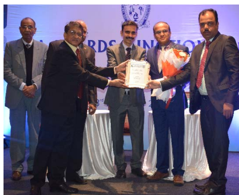
Abbott Healthcare (P) Ltd. team receiving the Best Innovative Packaging of Pharmaceutical Formulation Award 2017