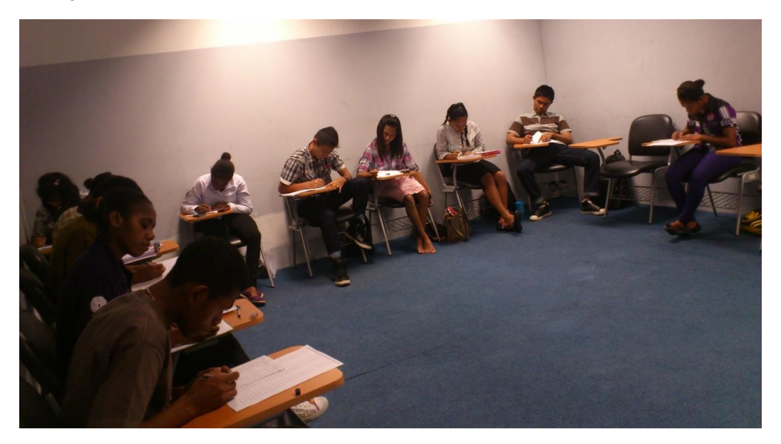
Figure 3. Student evaluation process using student worksheet.

The results show that the students can apply the multiplication in solving each problem is given in terms of evaluation. Therefore, it can be seen that learning multiplication operation in Math GASING can use to raise students' understanding in integer multiplication operations or other words, the design of this study can be used as the starting point of learning multiplication. In the last activities, teacher gives evaluation to measure the students' understanding in multiplication that can be seen in Figure 3.