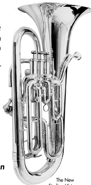
The New Sterling Virtuoso Euphonium