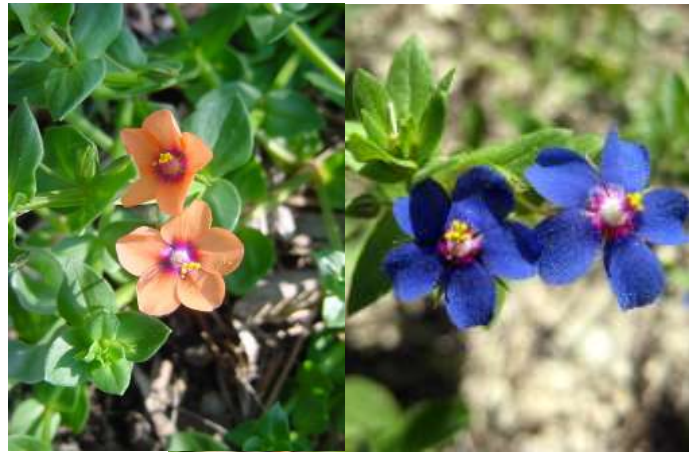
Blue Pimpernel, Anagallis monelli