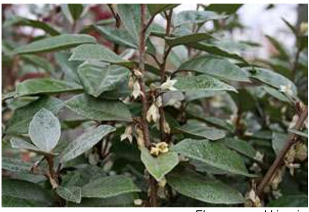
Elaeagnus x ebbingei