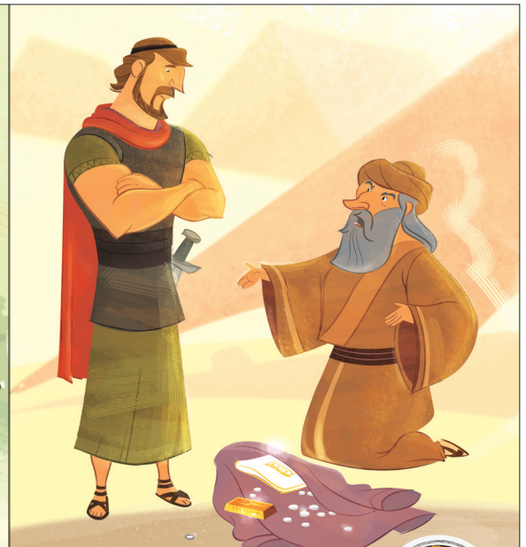
Achan Sinned Joshua 7