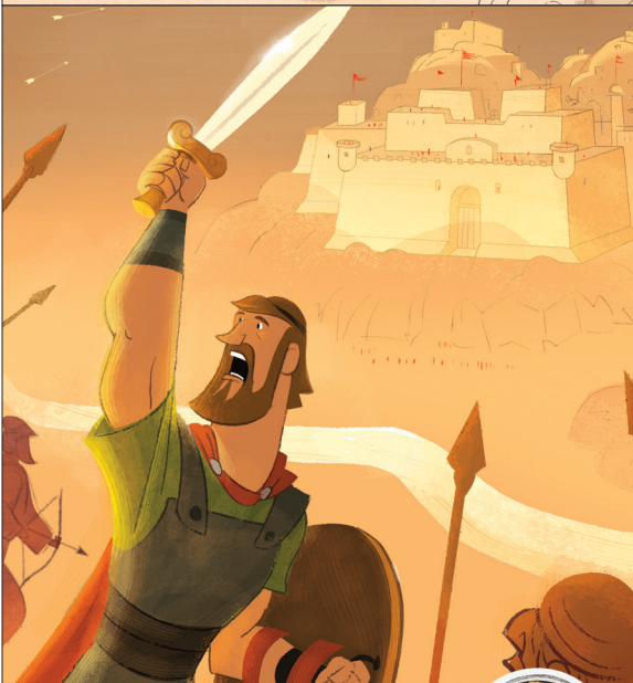
The Defeat of Ai Joshua 8