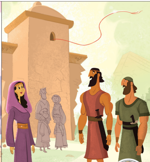
The Conquest of Jericho Joshua 2; 6