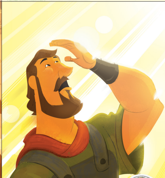
The Day the Sun Stood Still Joshua 10:1-15