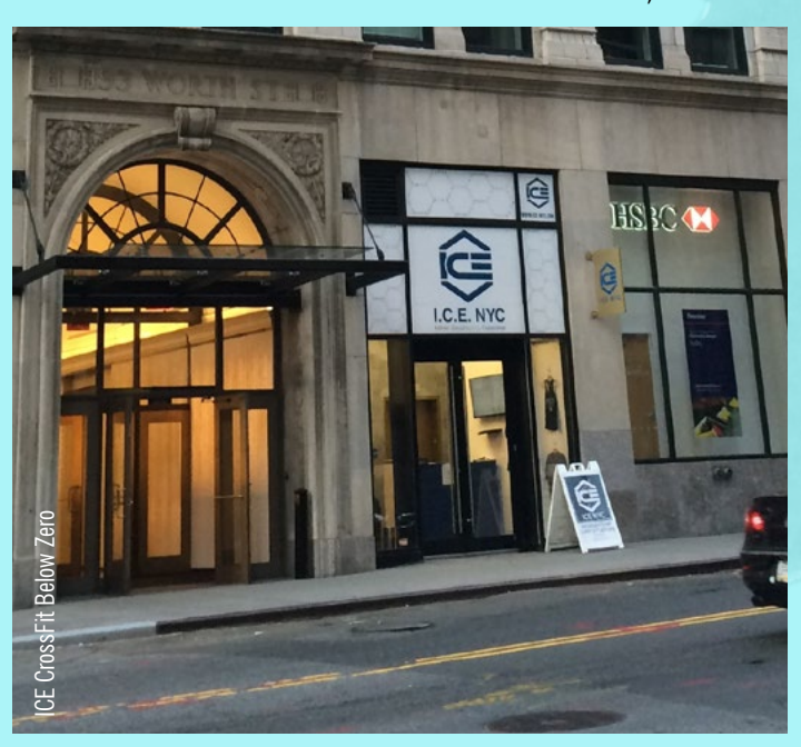
CrossFit Below Zero invested in acoustics studies to ensure happy neighbors.