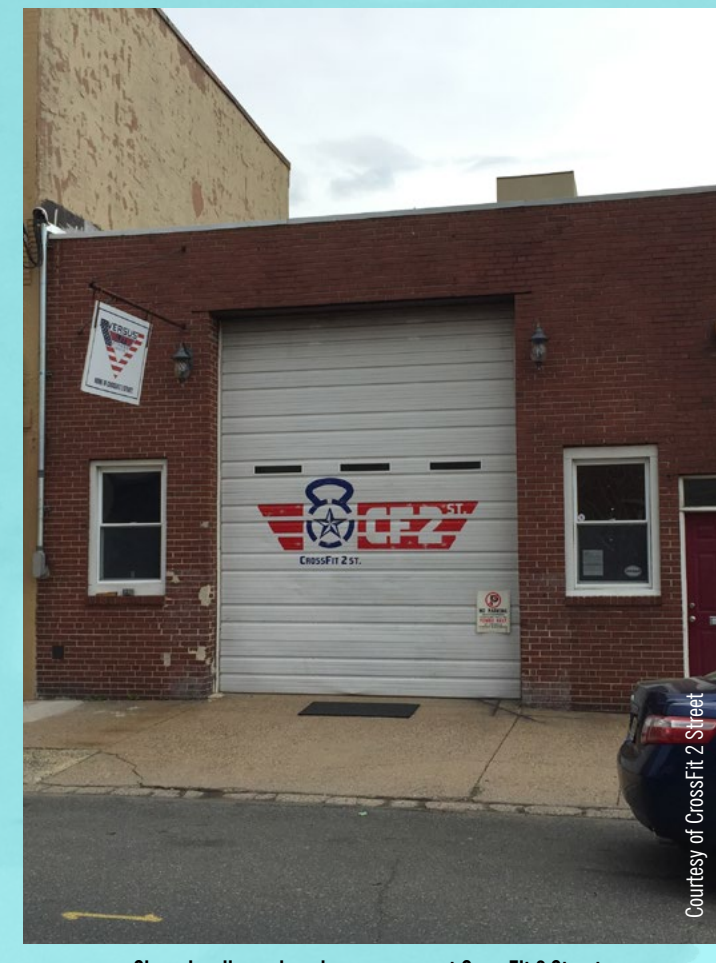
Shared walls made noise a concern at CrossFit 2 Street.

strong urban community ... and we've probably trained 1-2 percent of phia spot that would eventually become the affiliate's home.