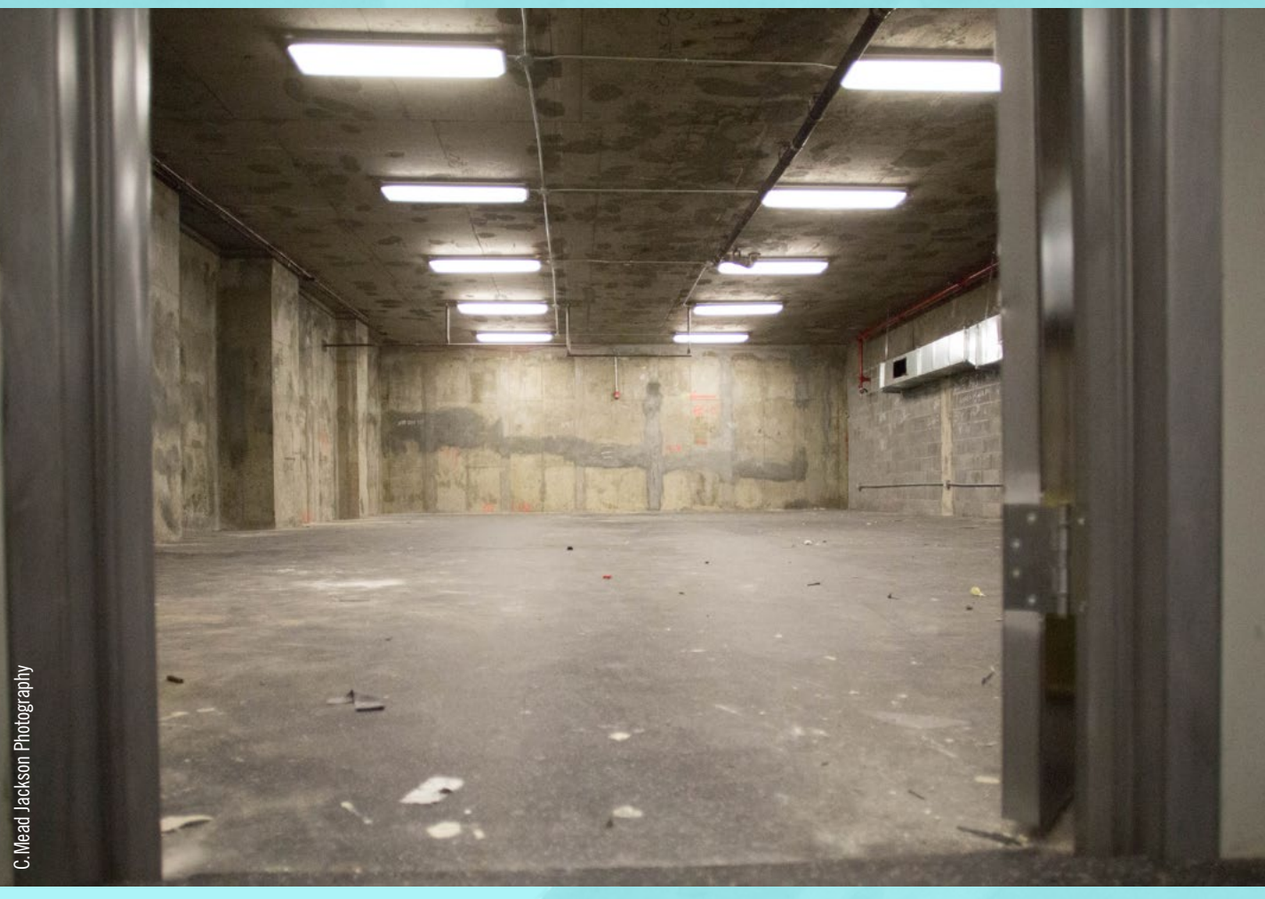
The crypt at CrossFit NYC: where burpees are banned by bureaucracy.

While searching for ways to expel the affiliate, the condo board's lawyers unearthed a decades-old R8 district zoning law dictating that no commercial space can be within 75 feet of the sidewalk on Columbus avenue—above or below ground. Most of the affiliate was safely within the commercial zone, but the last 50-by-25 feet bled into a residential district.