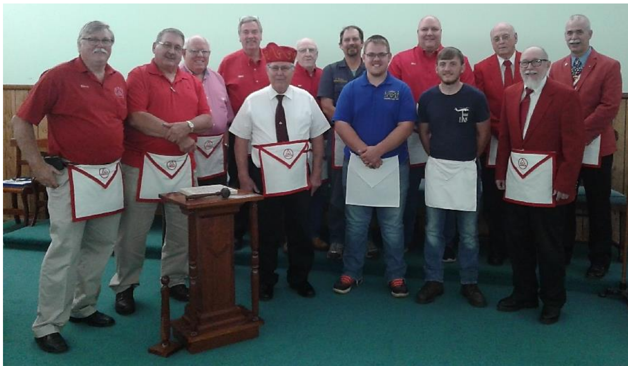
Most Excellent Master degree at Taylorsville Chapter, Saturday September 5, 2019