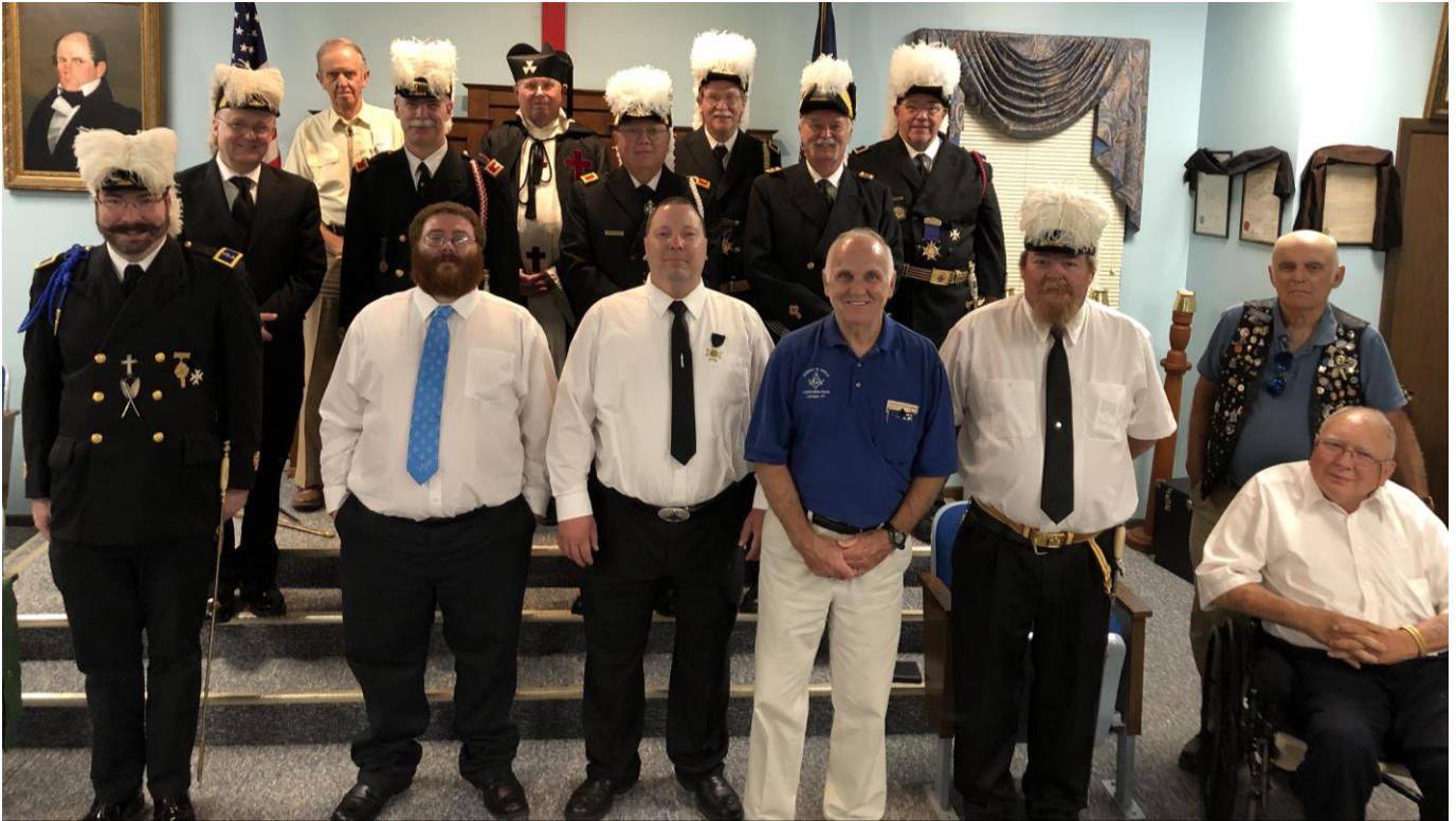
Richmond Commandery No 19 Order of the Temple, August 6, 2019