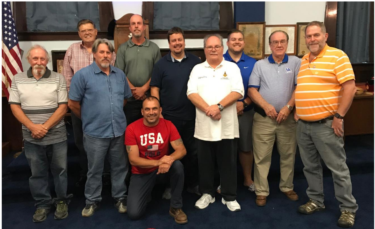
Candidates at Williamsburg festival, August 24, 2019.