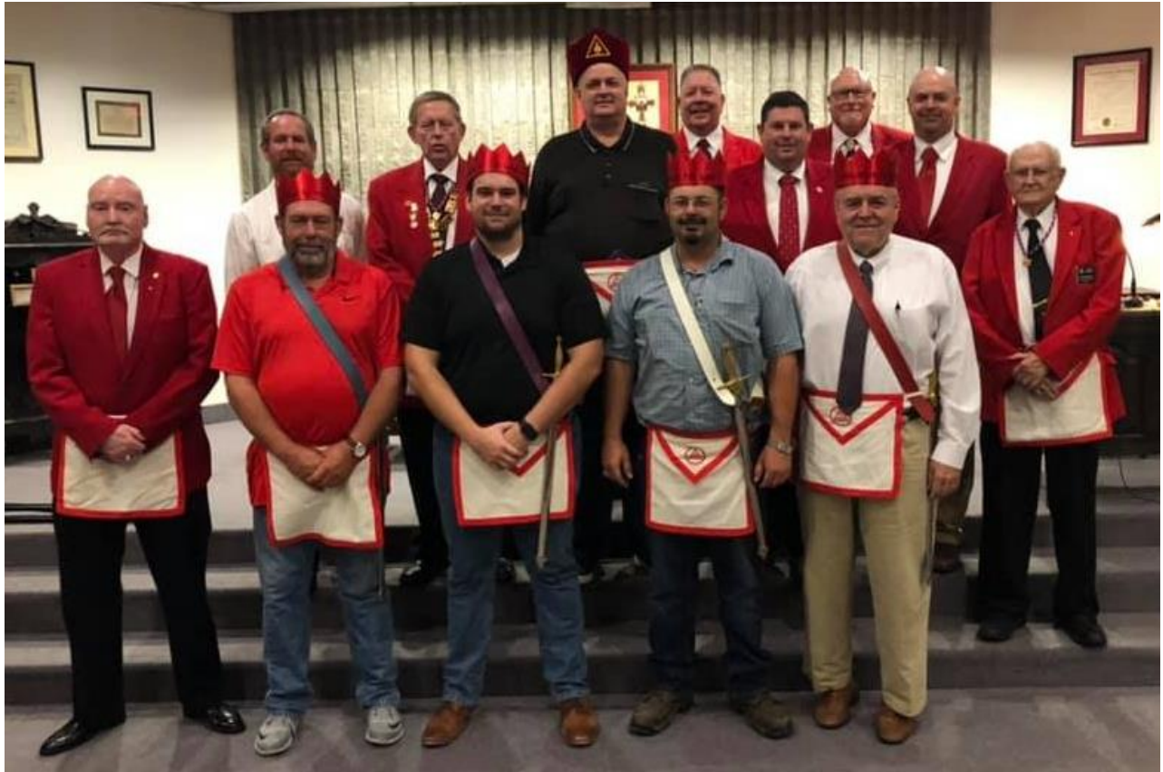
King Solomon Chapter No. 5 and Iroquois Chapter No 193 Royal Arch Degree, August 21.