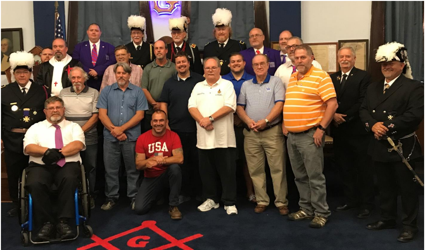
Candidates, cast and crew at Williamsburg festival on August 24, 2019