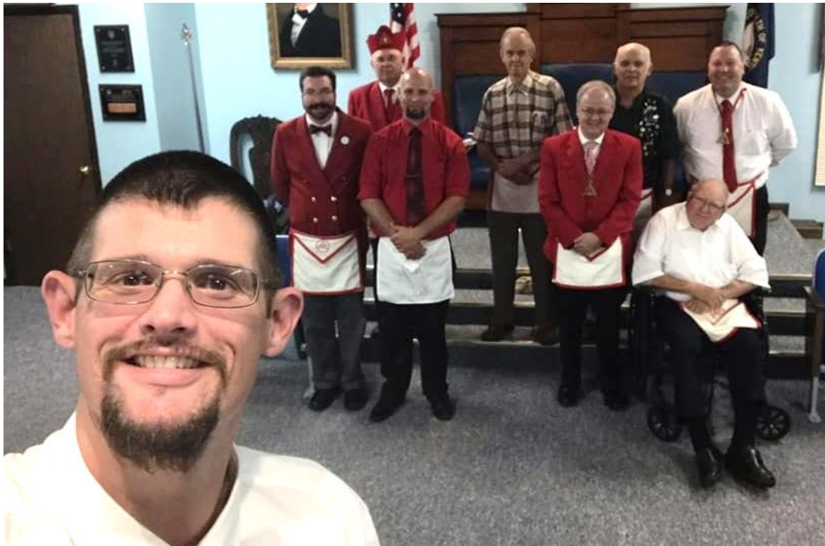
Mark and Past Master Degrees at Richmond Chapter on September 5, 2019