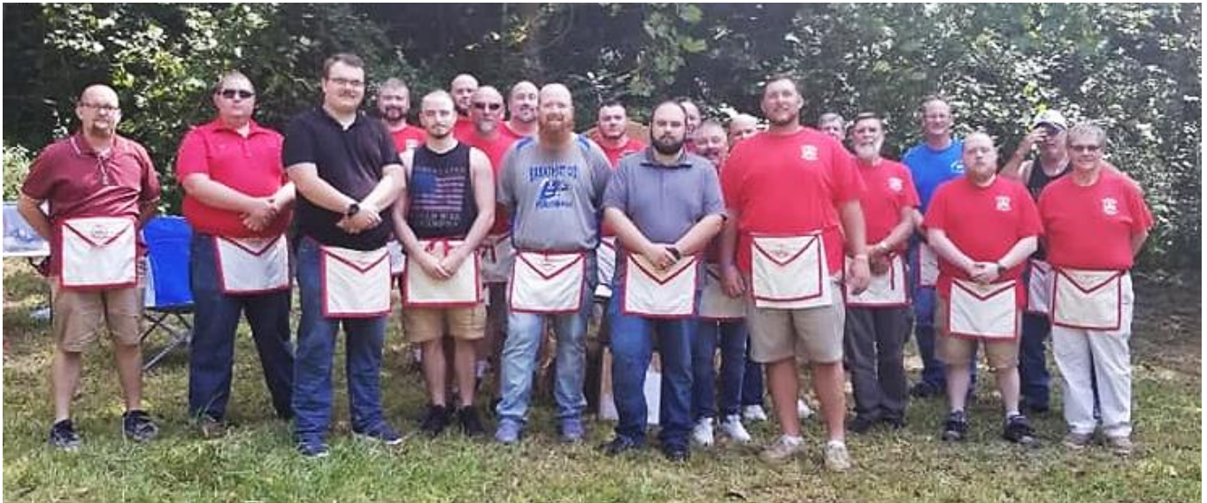
Prestonsburg Chapter #182 Outdoor Conferral August 17, 2019