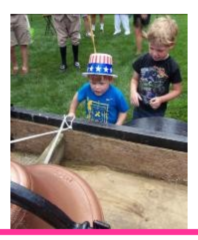
Pictures from the Fourth of July children's parade and bell ringing service at the Owl Creek Community in Louisville.